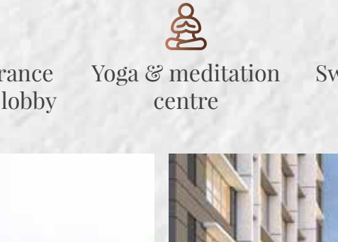
Yoga & meditation Swimming pool centre