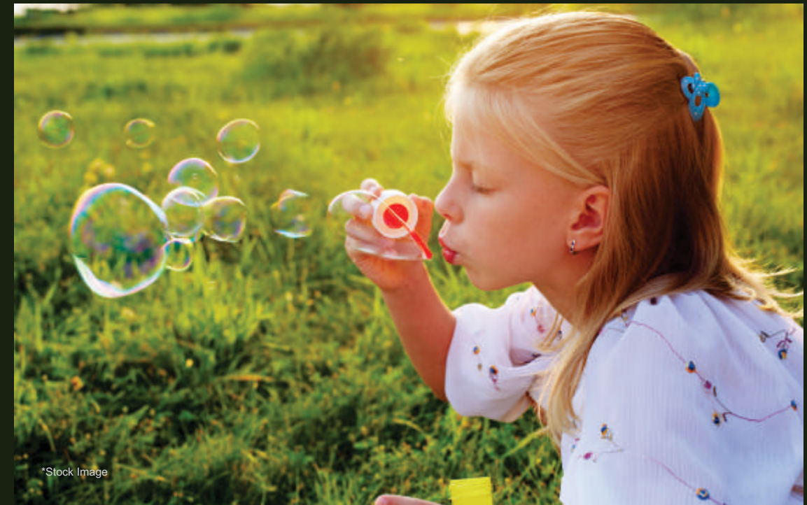
Beautifully landscaped gardens & children's play area

Although most residential projects have little or no space for kids, Park Reach boasts of a beautiful garden and a play area for kids. Dotted with various play equipment, these areas have an exciting blend of greens, browns and all the joyful shades of Nature.