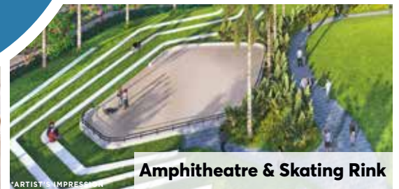
Amphitheatre & Skating Rink