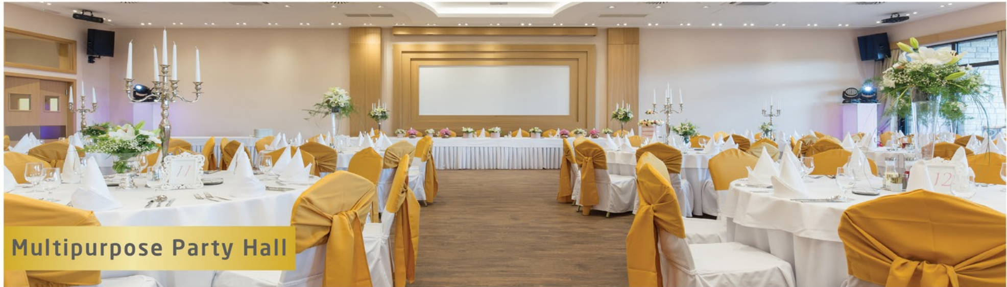
Multipurpose Party Hall