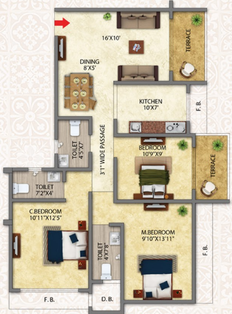
3 BHK Plan