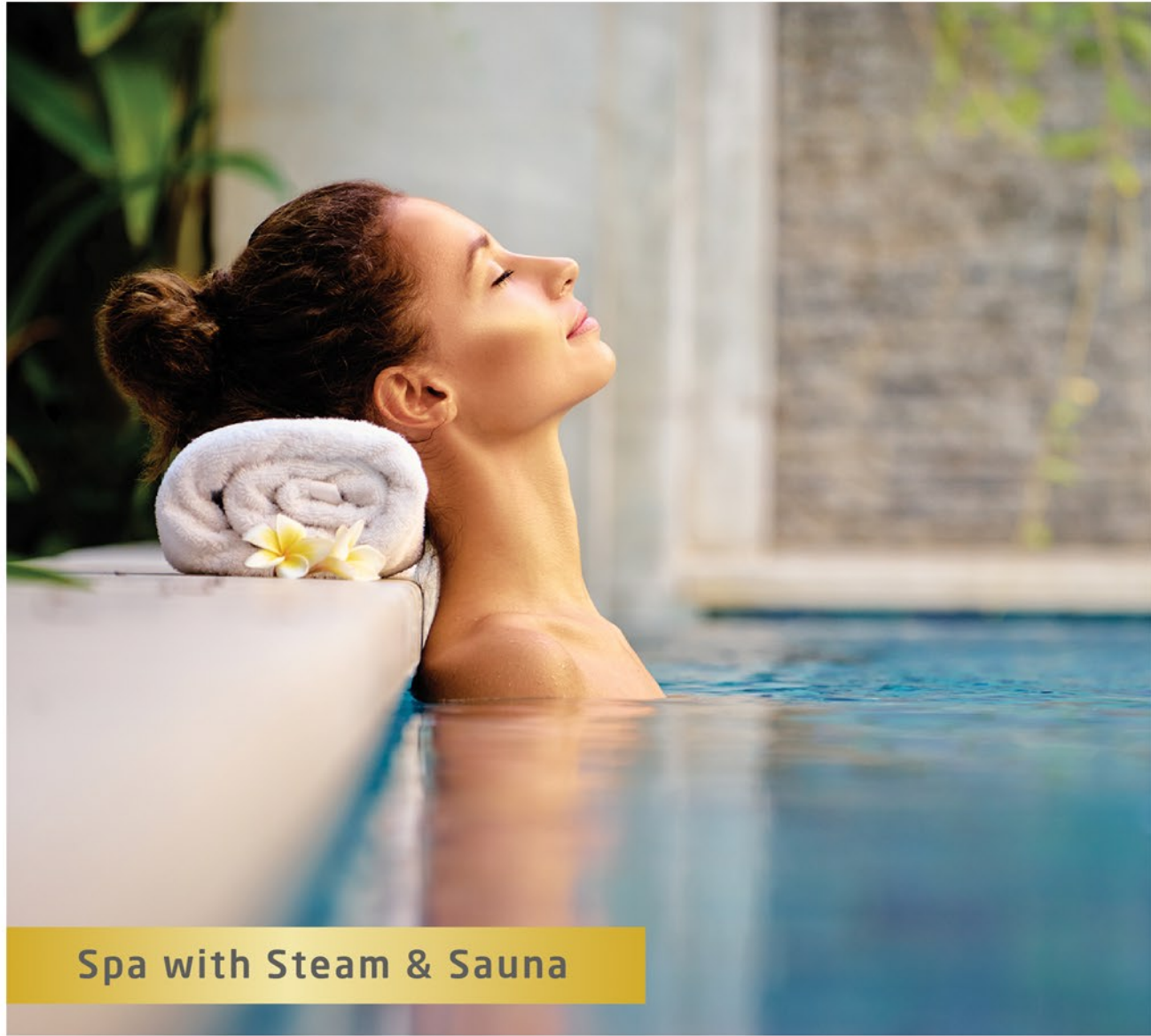
Spa with Steam & Sauna