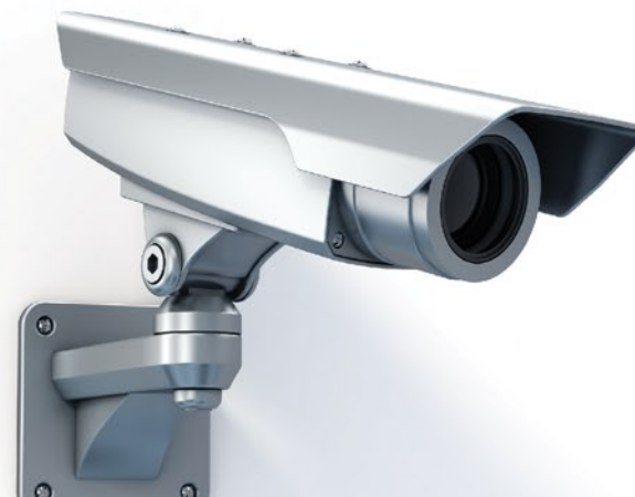
CCTV Surveillance Cameras