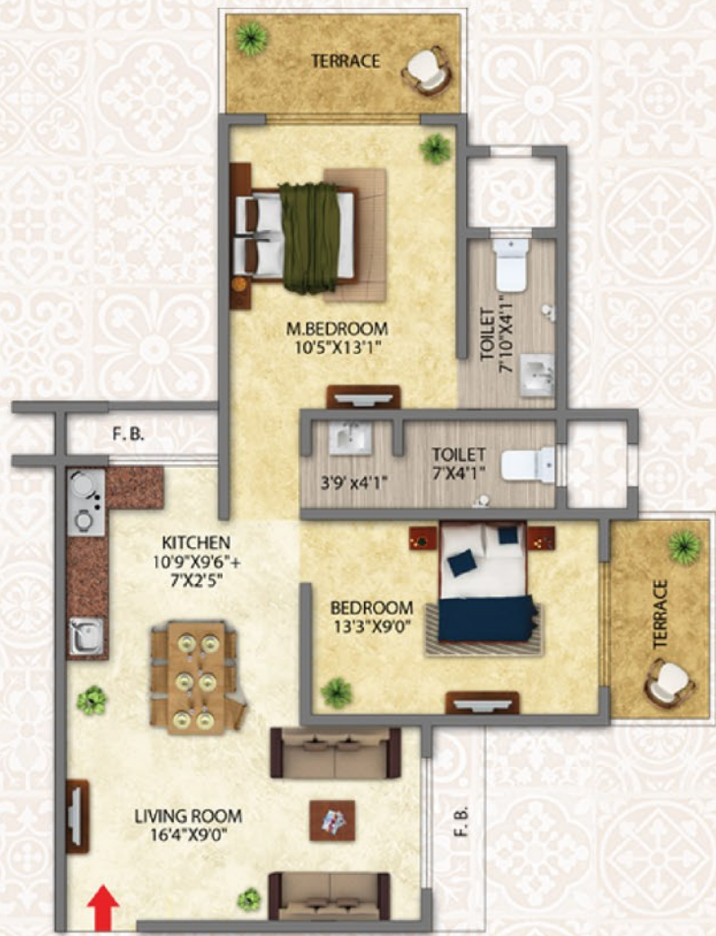
2 BHK Plan