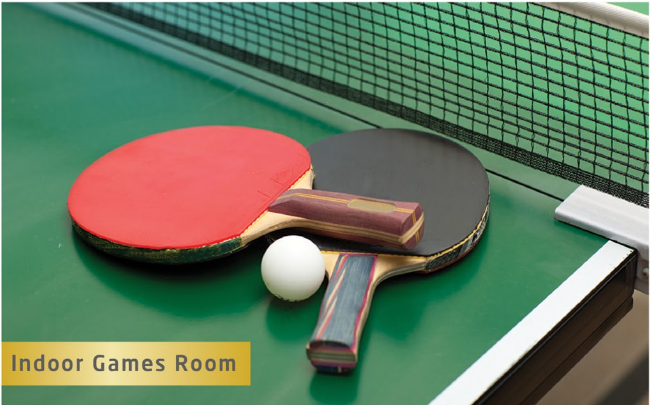
Indoor Games Room