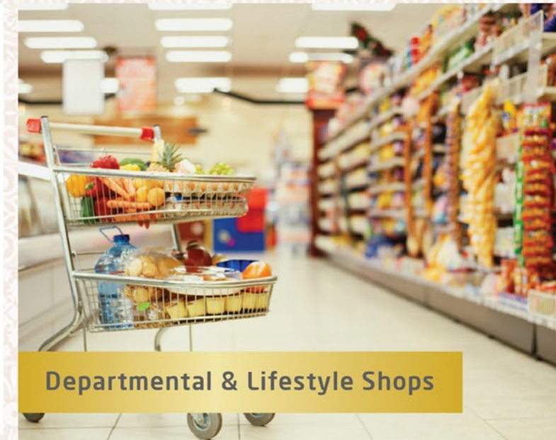
Departmental & Lifestyle Shops