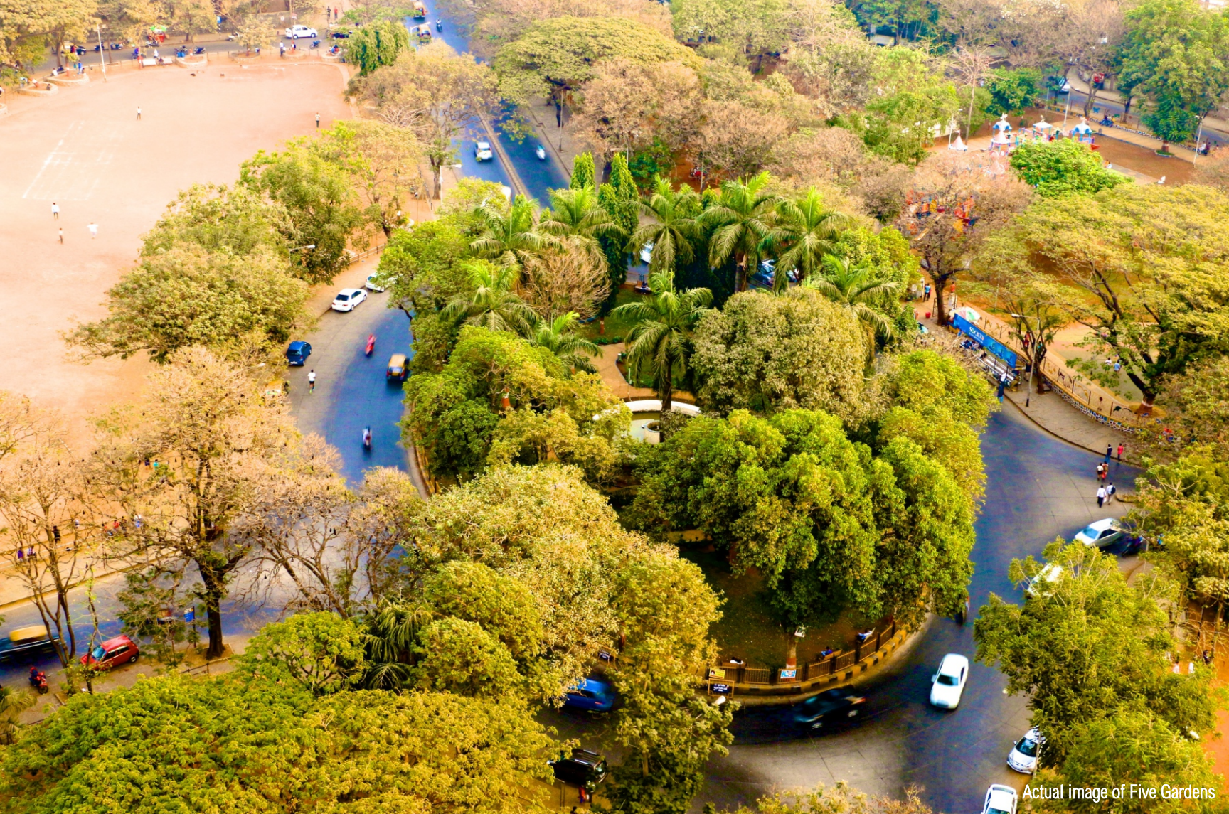
Actual image of Five Gardens

At Five Gardens, discover your ownself, connect with people and experience the joy of living....just a walk away from Praman Splendour!