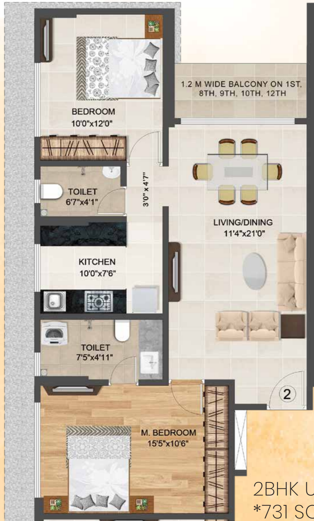
2BHK UNIT PLAN *731 SQ.FT