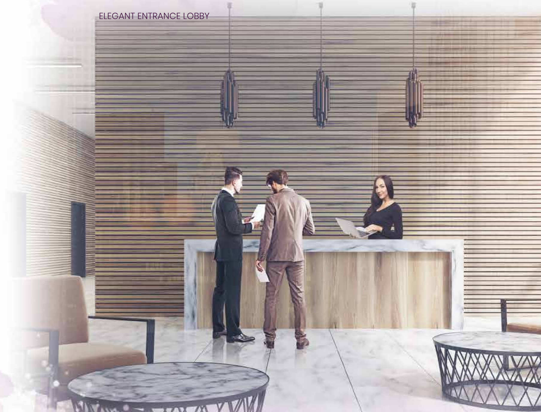
ELEGANT ENTRANCE LOBBY

LUXURIES THAT YOU AND YOUR FAMILY TRULY DESERVE