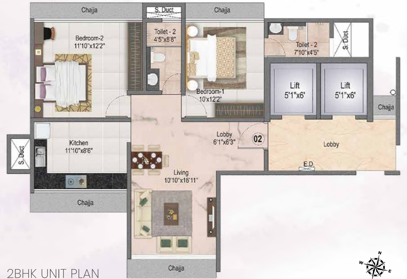
2BHK UNIT PLAN *733.02 SQ.FT UNIT NO. 502

*Disclaimer: All dimensions on floor plan are not to scale. The interiors, furniture, fittings, fixture, etc. shown in the image / drawing are only artist's conception and not part of actual amenities provided. All internal dimensions are from unfurnished wall surface. Minor verification / tolerance of +/- 3% in RERA carpet area mentioned may occur on account of design and / or construction exigencies.