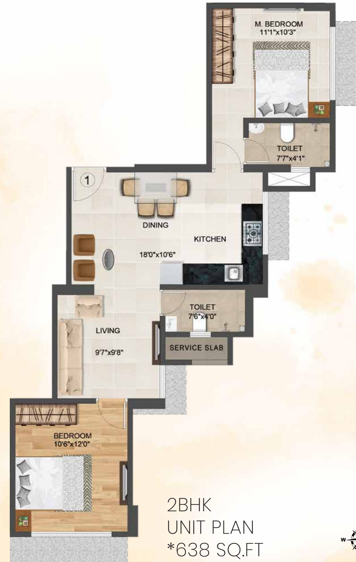
2BHK UNIT PLAN *638 SQ.FT

*Disclaimer: All dimensions on floor plan are not to scale. The interiors, furniture, fittings, fixture, etc. shown in the image / drawing are only artist's conception and not part if actual amenities provided. All internal dimensions are from unfurnished wall surface. Minor verification / tolerance of +/- 3% in RERA carpet area mentioned may occur on account of design and / or construction exigencies. Floor plans displayed are under amendment process with the concerned authorities.