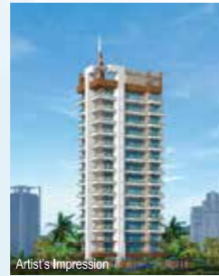
TULSI PRIDE Chembur, Mumbai