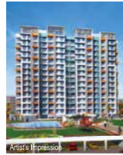
TULSI PRERNA New Panvel (W), Navi Mumbai