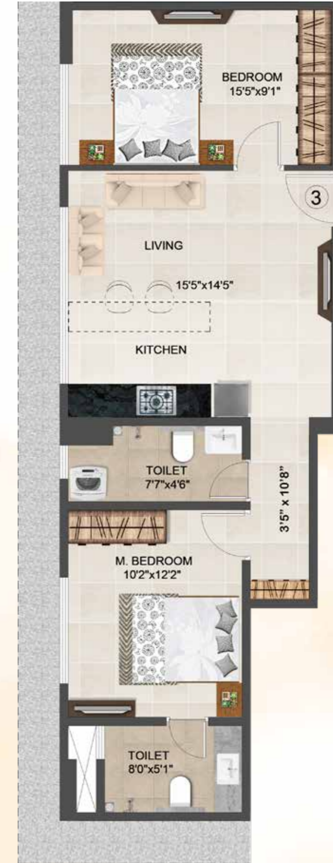
2BHK UNIT PLAN *634 SQ.FT