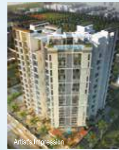
THE PALMS Palm Beach Road, Nerul