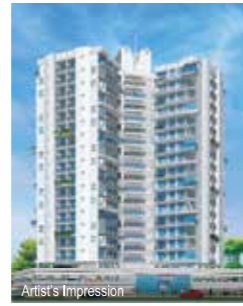
CHAURANG Sanpada, Navi Mumbai