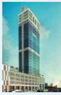
FAIRMOUNT Sanpada, Navi Mumbai