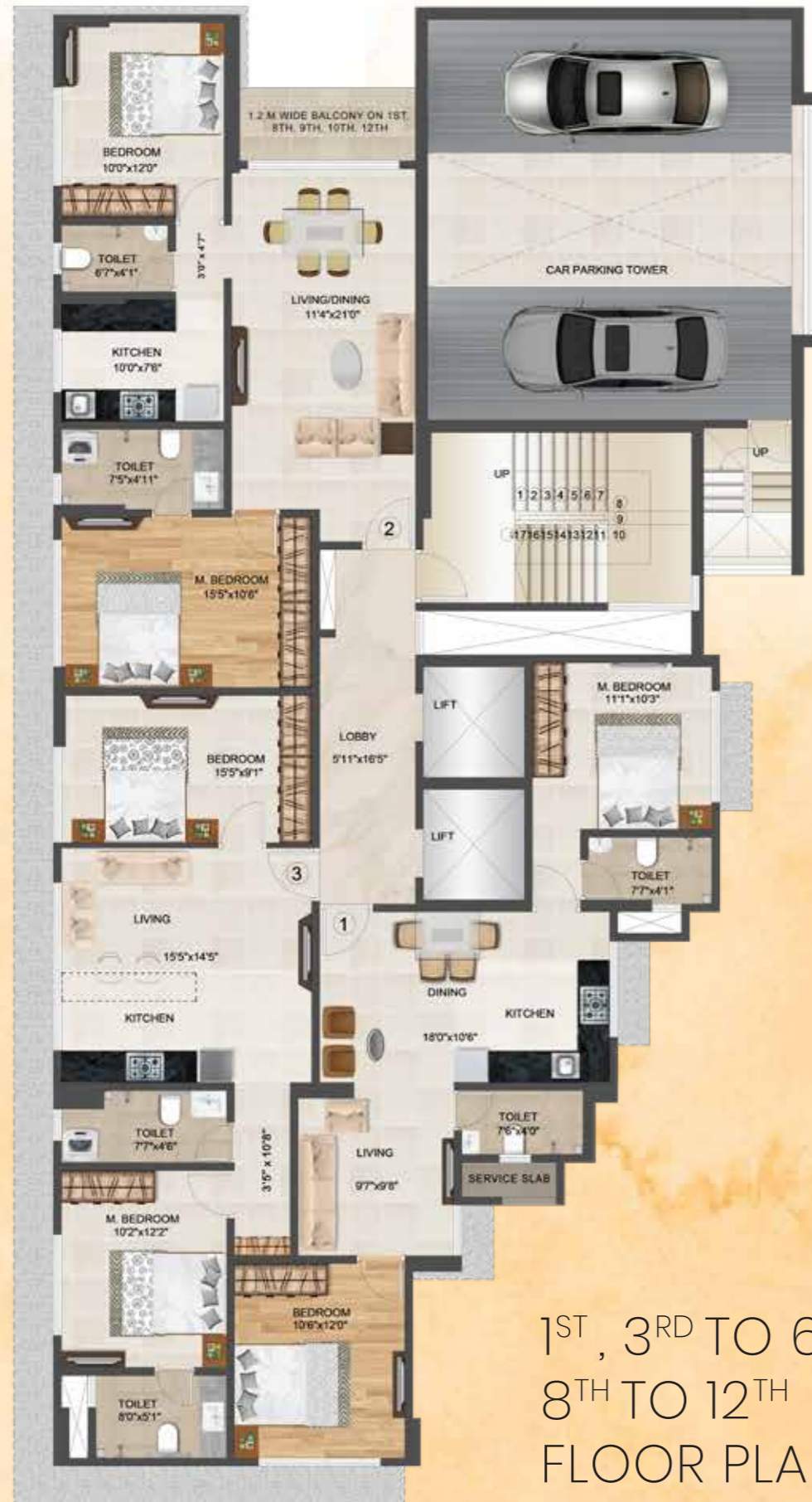
1 ST , 3 RD TO 6 TH , 8 TH TO 12 TH FLOOR PLAN