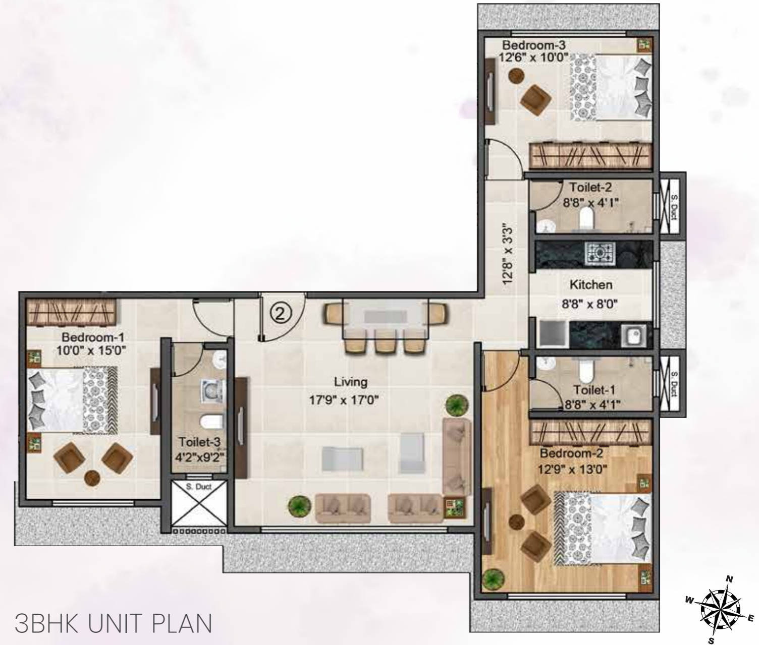
3BHK UNIT PLAN *1057.88 SQ.FT

*Disclaimer: All dimensions on floor plan are not to scale. The interiors, furniture, fittings, fixture, etc. shown in the image / drawing are only artist's conception and not part if actual amenities provided. All internal dimensions are from unfurnished wall surface. Minor verification / tolerance of +/- 3% in RERA carpet area mentioned may occur on account of design and / or construction exigencies.