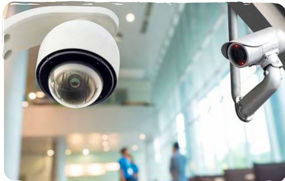
24X7 CCTV SURVEILLANCE