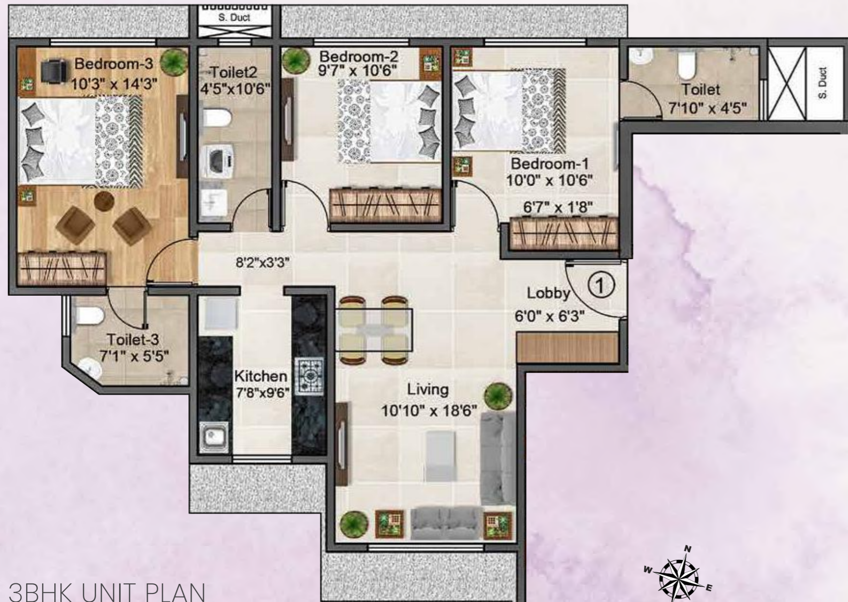
3BHK UNIT PLAN *868.33 SQ.FT

*Disclaimer: All dimensions on floor plan are not to scale. The interiors, furniture, fittings, fixture, etc. shown in the image / drawing are only artist's conception and not part if actual amenities provided. All internal dimensions are from unfurnished wall surface. Minor verification / tolerance of +/- 3% in RERA carpet area mentioned may occur on account of design and / or construction exigencies.