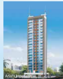
CHAURANG HEIGHTS Kharghar, Navi Mumbai