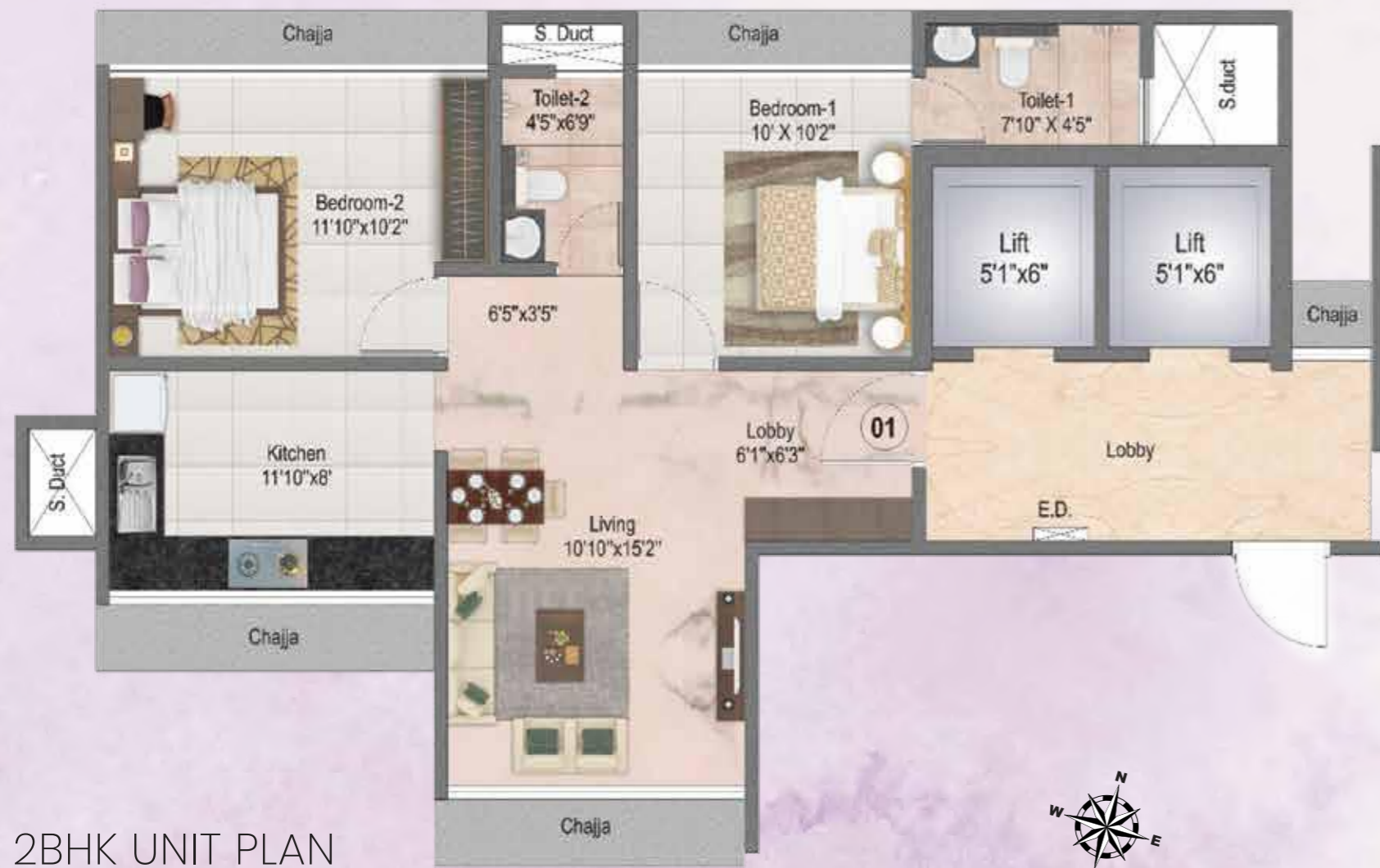
2BHK UNIT PLAN *649.71 SQ.FT UNIT NO. 301

*Disclaimer: All dimensions on floor plan are not to scale. The interiors, furniture, fittings, fixture, etc. shown in the image / drawing are only artist's conception and not part of actual amenities provided. All internal dimensions are from unfurnished wall surface. Minor verification / tolerance of +/- 3% in RERA carpet area mentioned may occur on account of design and / or construction exigencies.