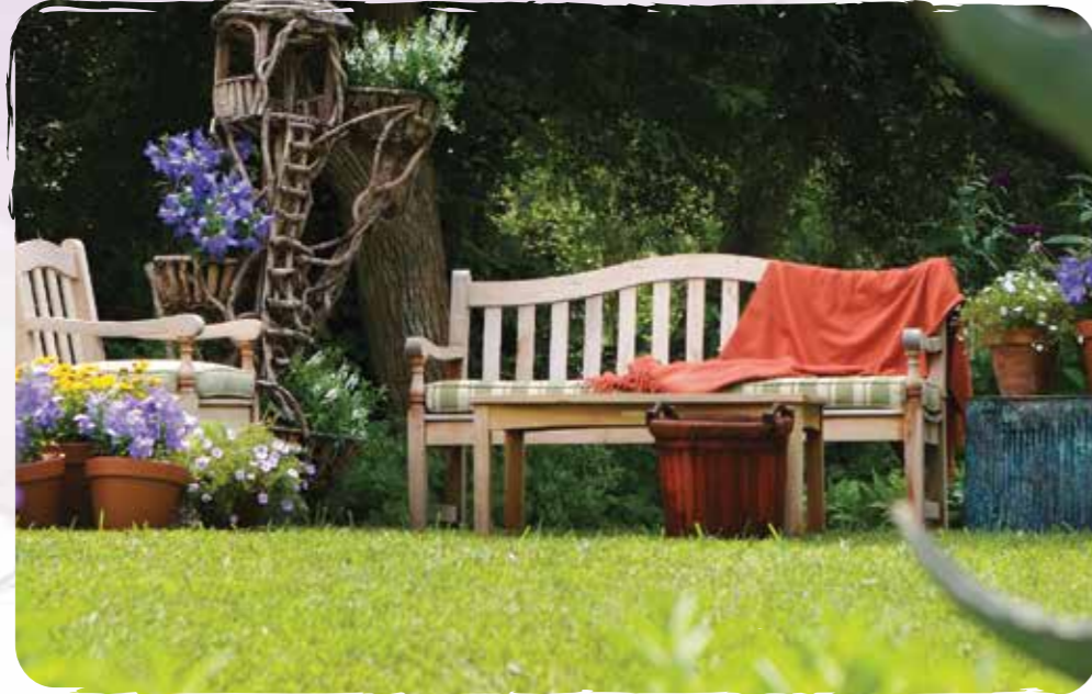
OPEN TO SKY SIT-OUTS