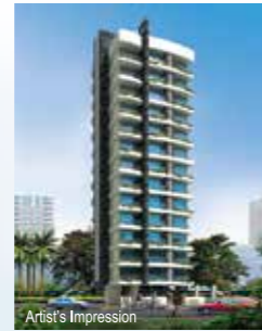
TULSI MAJESTIC Chembur, Mumbai