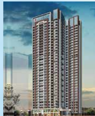
PARAMOUNT Nr. Shil Phata Junction