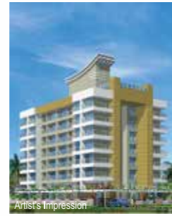
TULSI MEADOWS Chembur, Mumbai