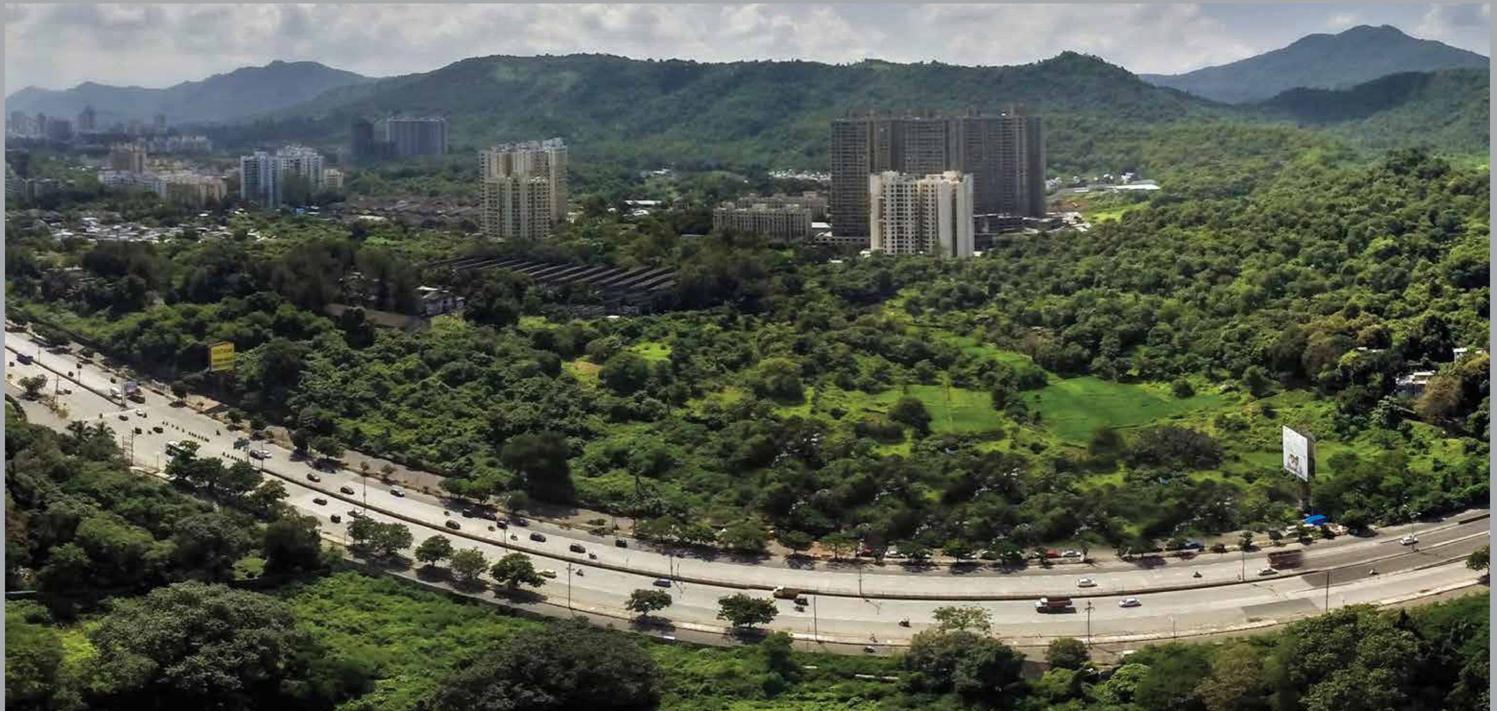
Actual image of Ghodbunder Road, Thane

In today's fast-paced world, it is eminent to make optimum utilisation of time. Therefore, one has to wisely choose the destination for their business. Being settled in Thane, Solus enjoys a plethora of location advantages. It offers supreme level of convenience as all essentials are within the vicinity.