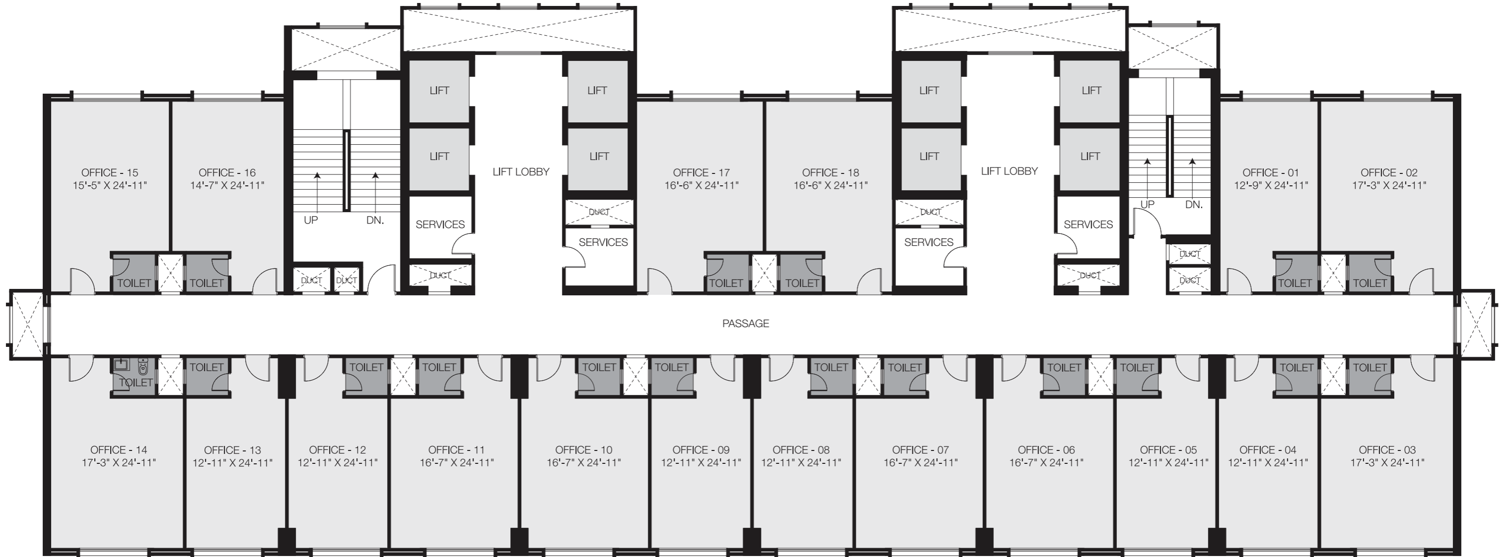
Carpet Area Statement