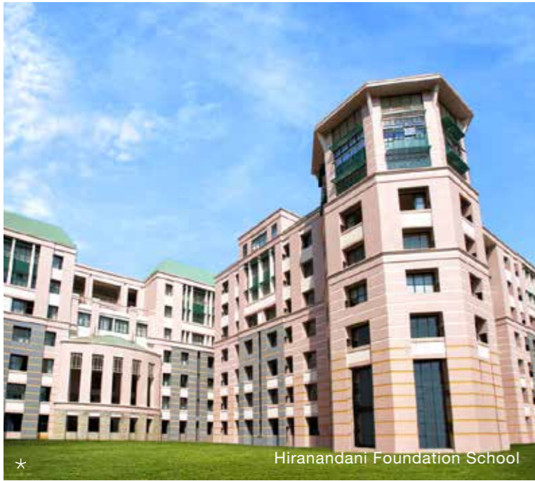
Hiranandani Foundation School