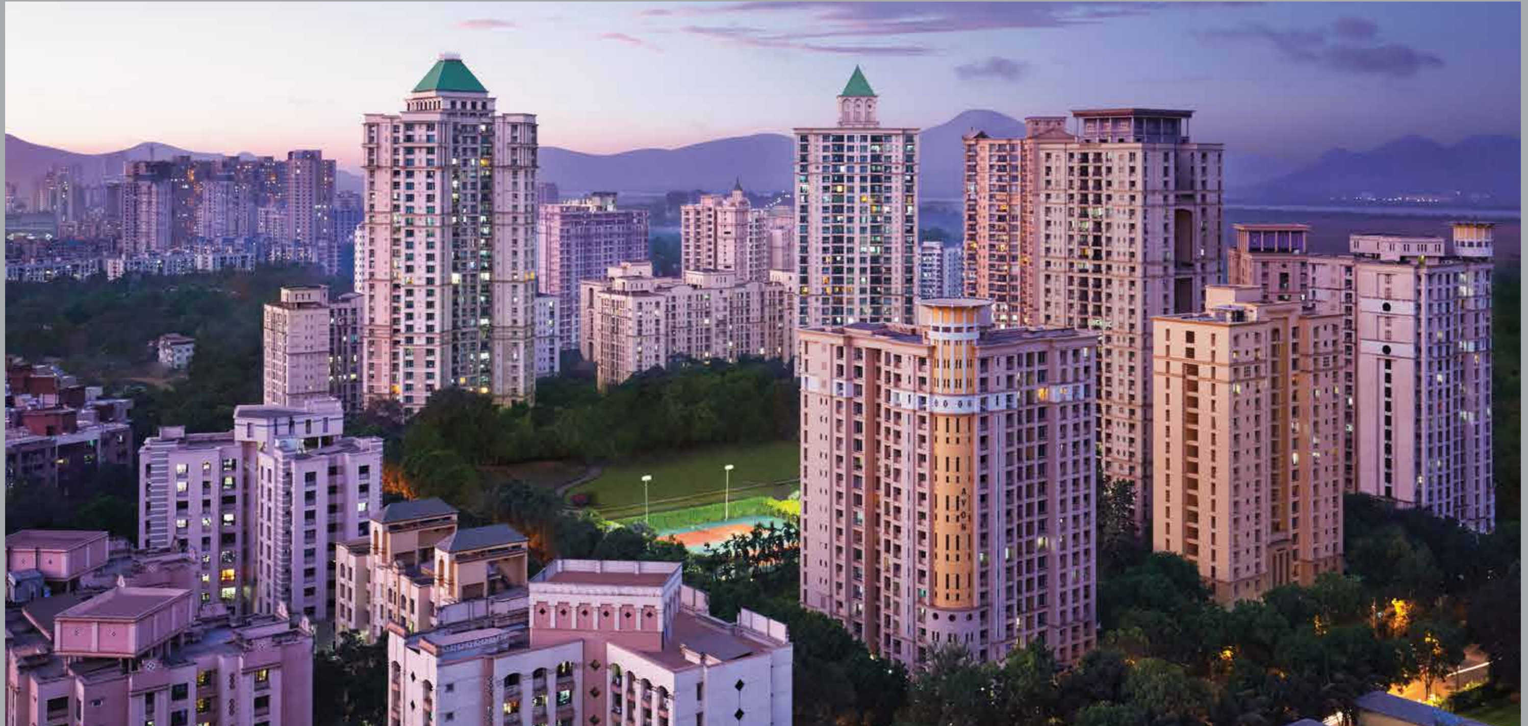
Actual image of Hiranandani Estate, Thane

Hiranandani Estate, Benchmarking community living in Thane.