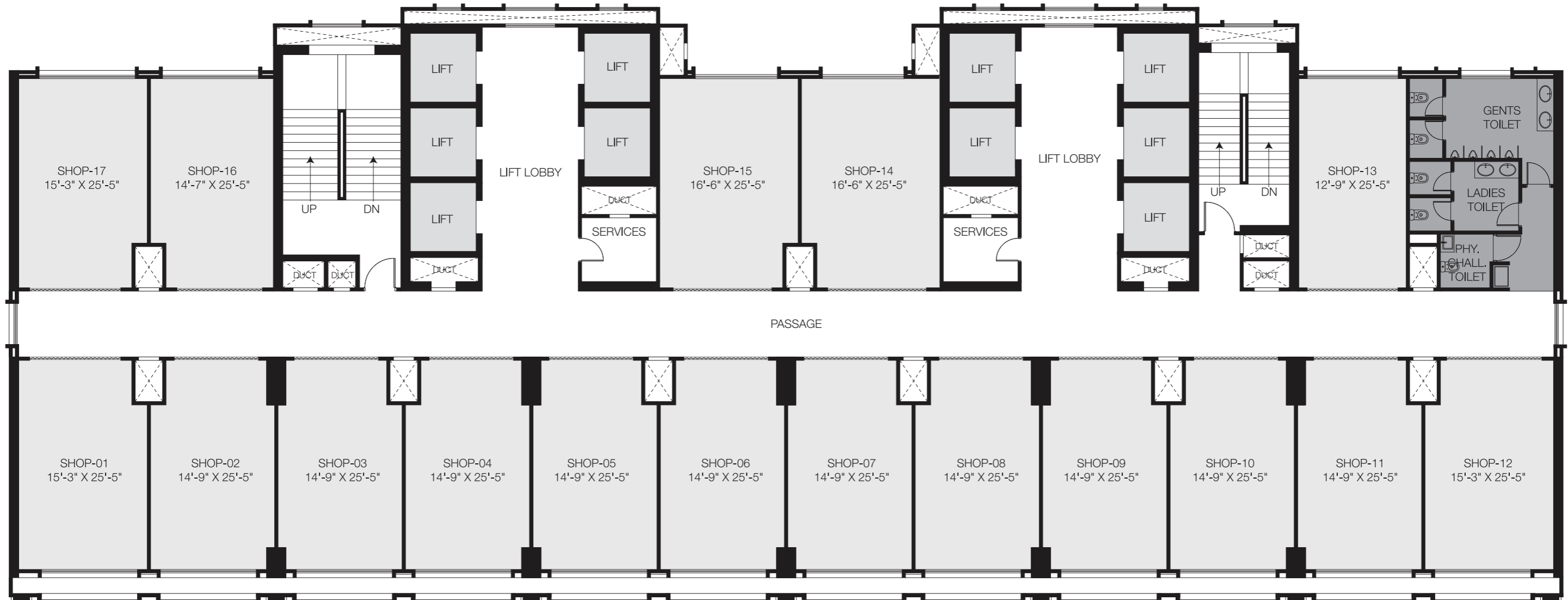
Carpet Area Statement