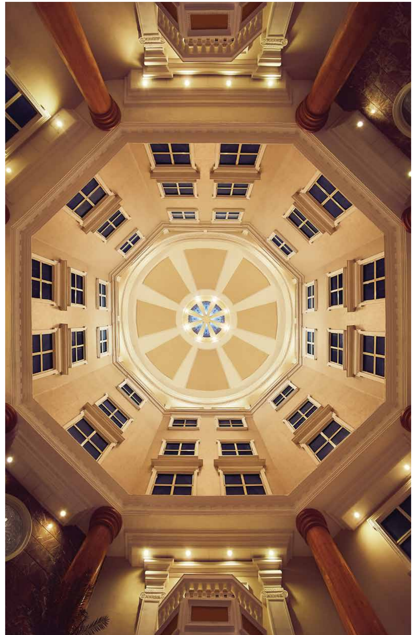
Interior image of Olympia, Hiranandani Gardens, Powai.

Every Hiranandani township reflects this commitment to raising a complete world that looks into all aspects of living. Diverse ventures come together to create an integrated experience, minutely balancing all areas of happiness. An eco-friendly ambience, convenient infrastructure, luxurious lifestyle and proximity to work are seamlessly incorporated together, adding depth and joy to daily life.