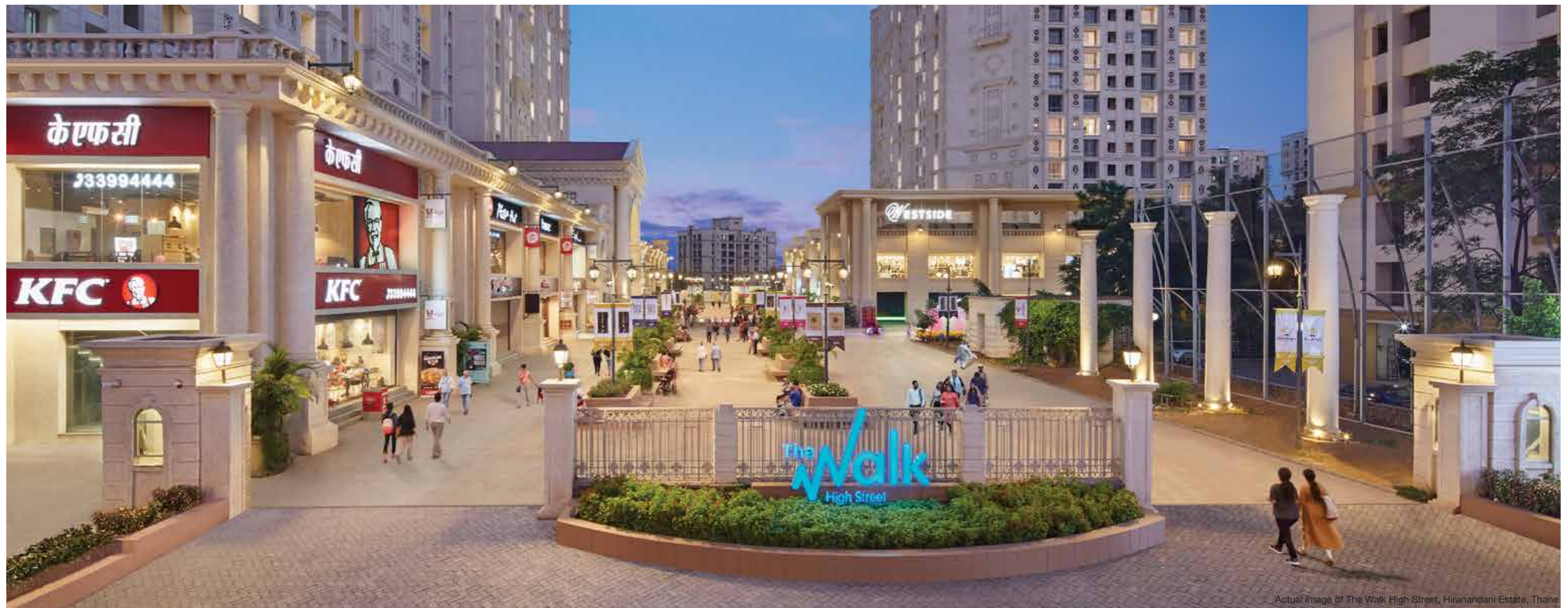
Actual image of The Walk High Street, Hiranandani Estate, Thane