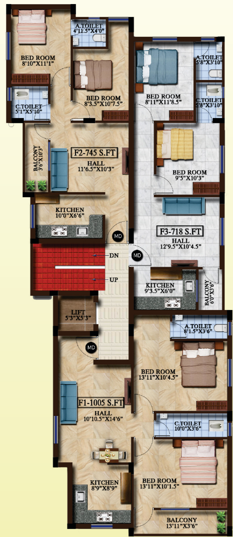
First Floor & Second Floor Plan