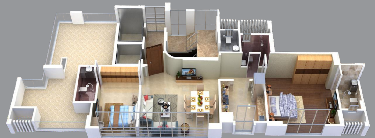
6th Floor - 2 BHK - 1007 sq. ft.