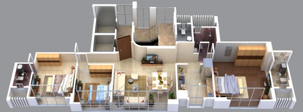
5th Floor - 3 BHK - 1180 sq. ft.