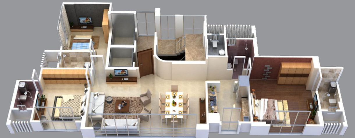
7th to 14th Floor - 3 BHK - 1382 sq. ft.