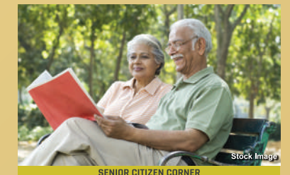
SENIOR CITIZEN CORNER