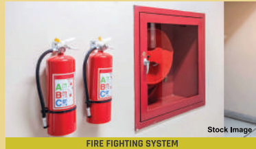
FIRE FIGHTING SYSTEM