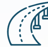
Road Widening Projects