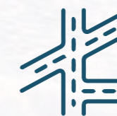
Mumbai Trans-Harbour Link via Eastern Freeway