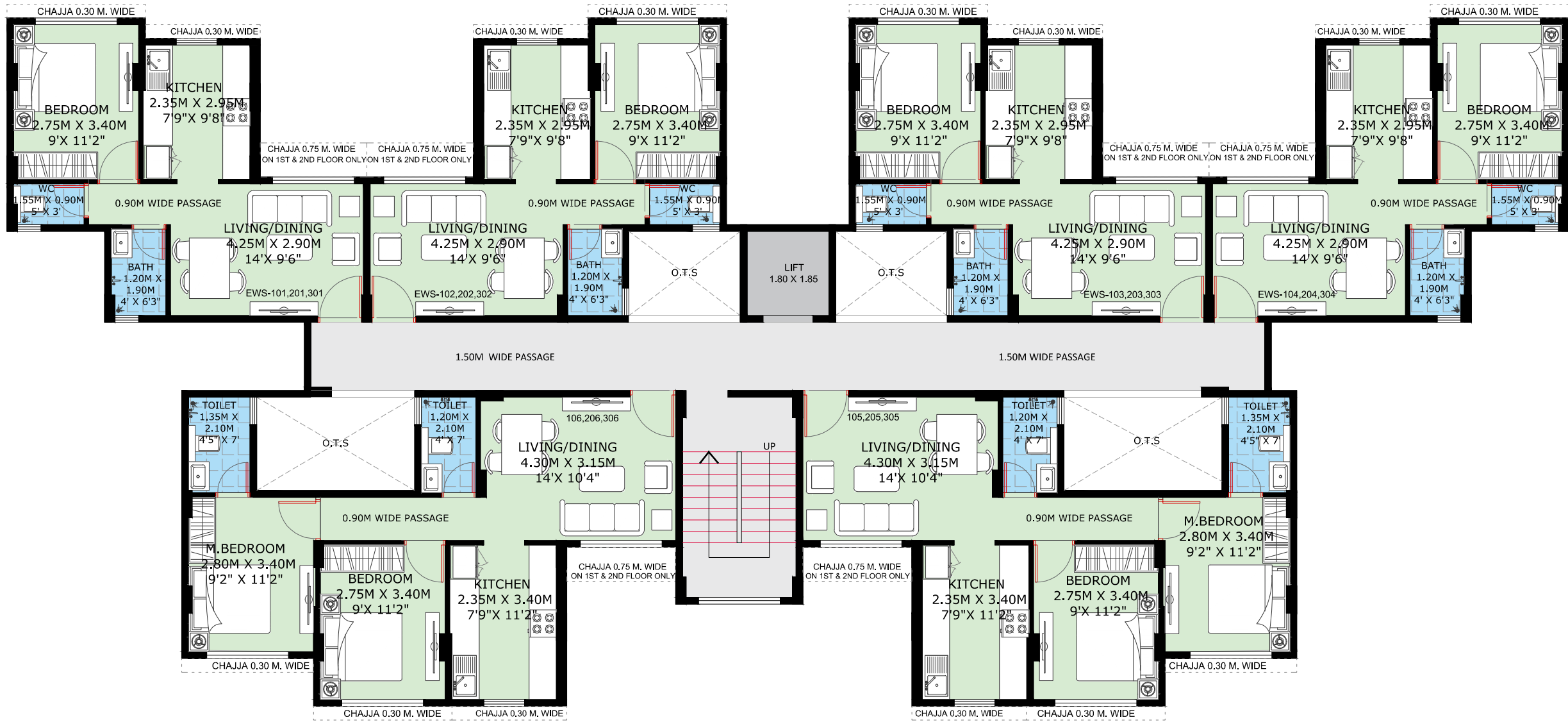
TYPICAL 1ST TO 3RD FLOOR PLAN ( BUILDING - B ) SCALE-1 : 100