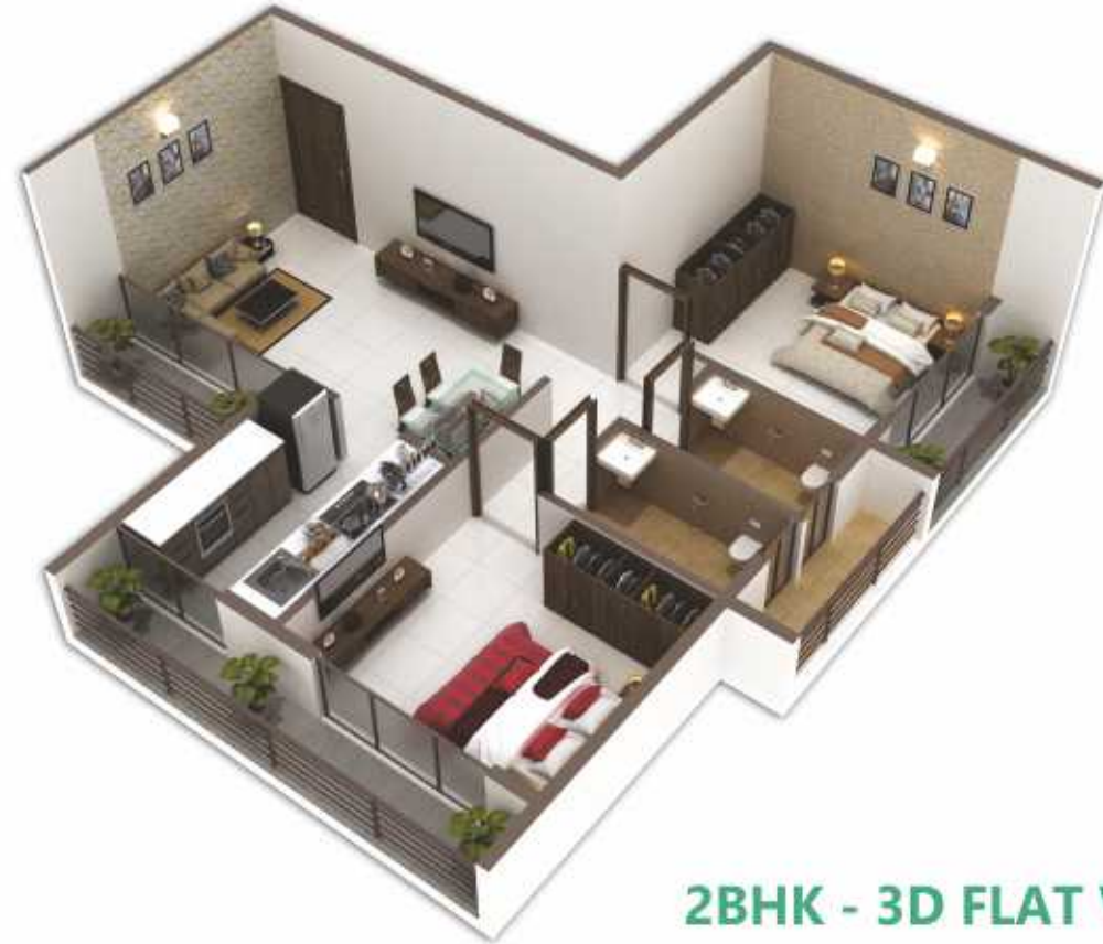
2BHK - 3D FLAT VIEW