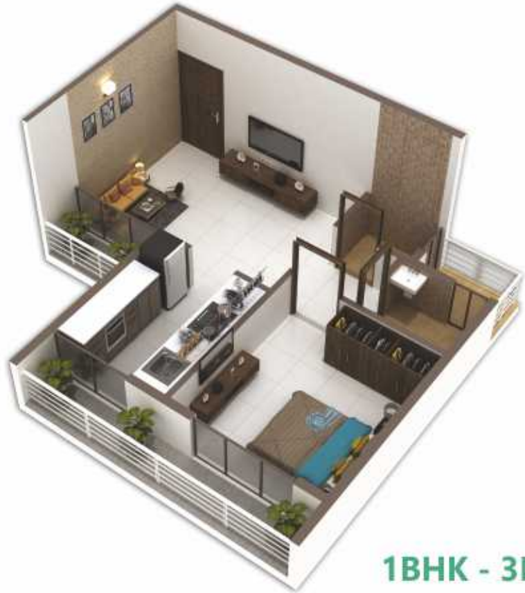
1BHK - 3D FLAT VIEW