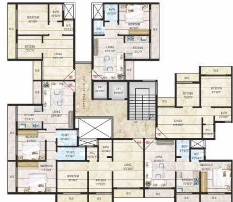
TYPICAL FLOOR PLAN (WING-D, E, F, H, I, L & M)