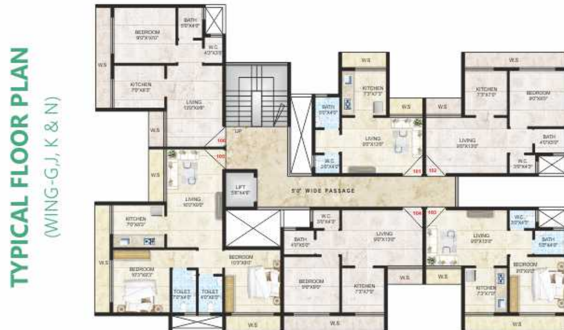
TYPICAL FLOOR PLAN (WING-G, J, K & N)