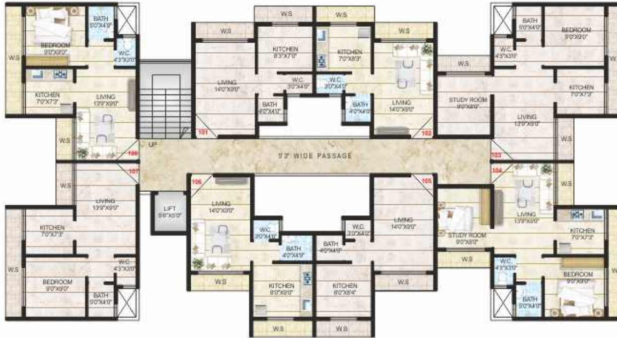
TYPICAL FLOOR PLAN (WING-A, B & C)