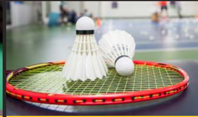
open badminton ground