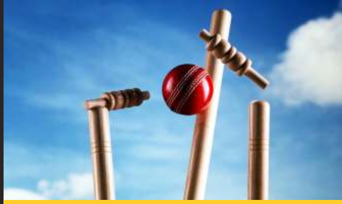
Small Cricket Court