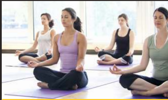
Club House With Gymnasium