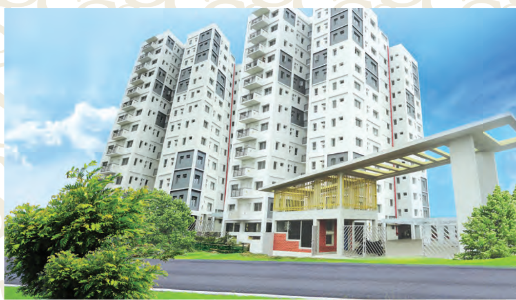
KRISHNAGAR SENTRUM, KRISGNAGAR, WEST BENGAL