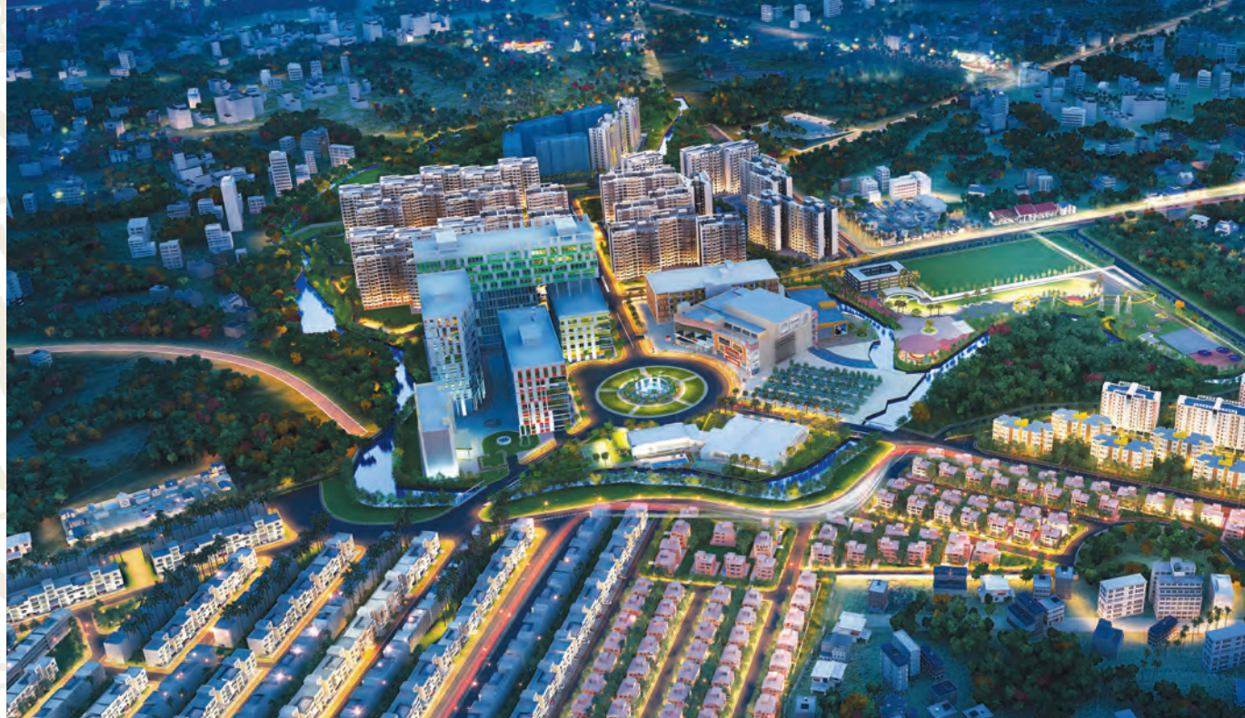
SHRISTINAGAR, ASANSOL, WEST BENGAL

It is dedicated towards the contribution of the development of society by creating business enterprises which have long-term and sustainable objectives. Its ethos is captured in its tagline 'Work With Devotion', through the constant churning of ideas and hard work, implementing it with passion and focussing on the results. Its operational philosophy is based on a strong foundation of morals, values and culture.