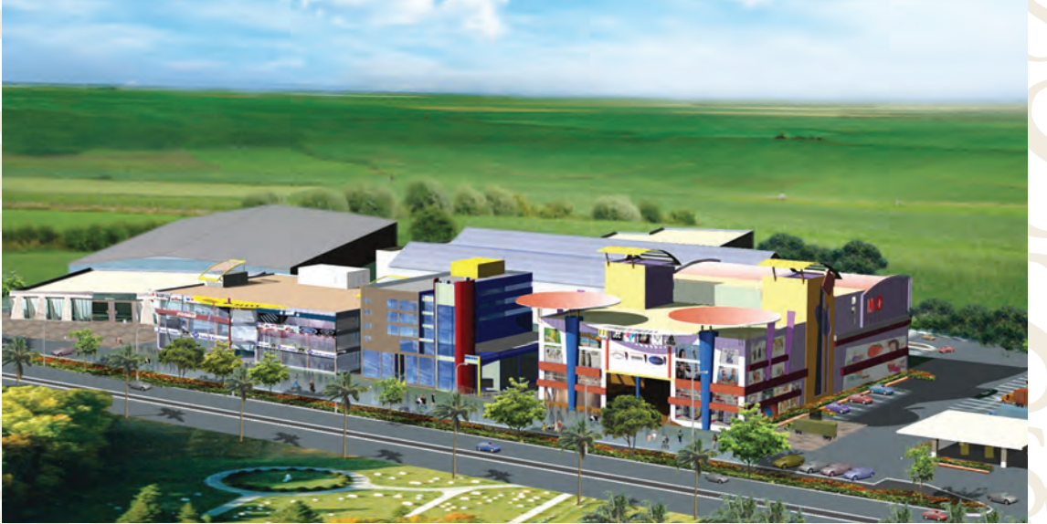
RANIGANJ SQAURE – THE HIGHWAY HUB, RANIGANJ, WEST BENGAL