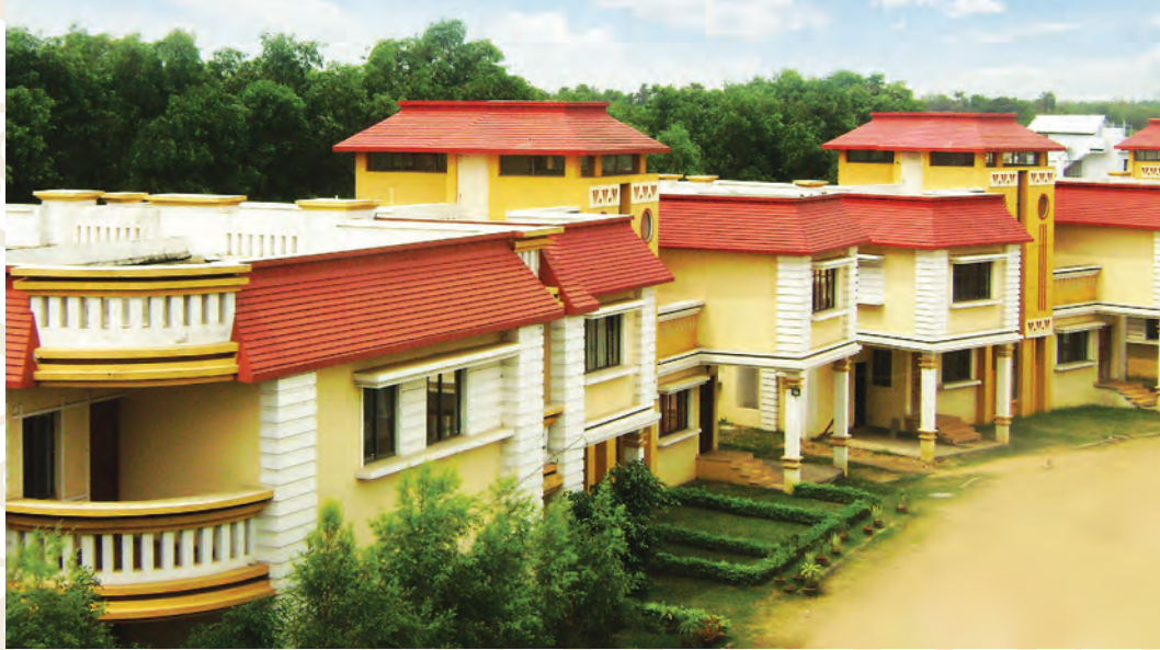
SHANTI SHRISTI, SANTINIKETAN, WEST BENGAL