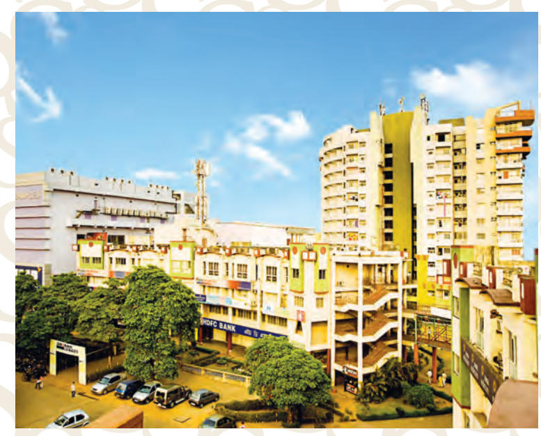
CITY CENTRE, DURGAPUR, WEST BENGAL