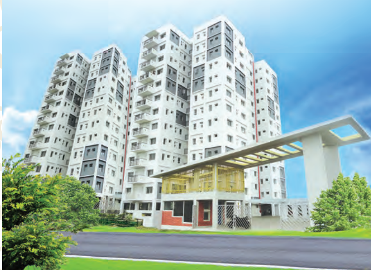
THE ARENA, HALDIA, WEST BENGAL