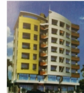
New Krishna Niwas, Roshan Nagar, Borivali West (2006)