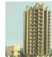
Eksar Heights, Eksar Road, Borivali West (2012-2014)