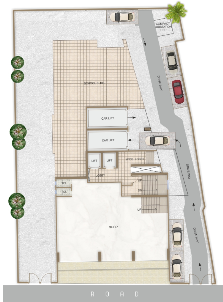
LAYOUT FLOOR PLAN

Emerging on the Kasturba Road in Borivali (East), your employees and clients will just bless you for taking care of their travel woes, day-in and day-out. With two car lifts, adequate car parking, water well and a substation in the premises, PBC is ready to take your business to new heights.