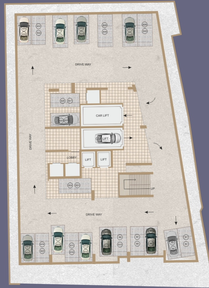
BASEMENT FLOOR PLAN

PBC is designed to the highest standards and includes all modern amenities to make working comfortable and enjoyable. PBC is brought to you by known experts from the industry, whose code and standards reflect in every piece of work created.