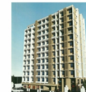
Ganesh Krupa, Shimpoli, Borivali West (2012-2014)