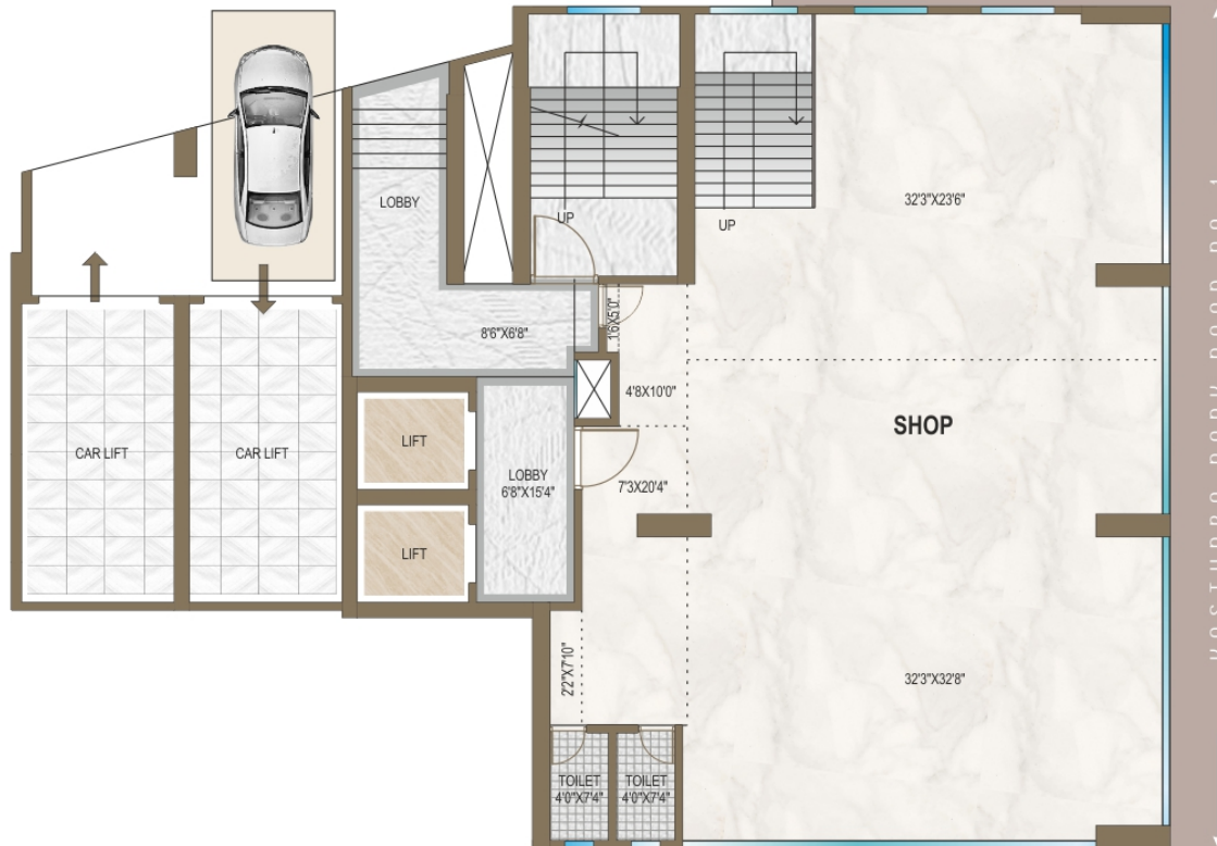
GROUND & FIRST FLOOR PLAN

*Subject to the approval from concern authorities