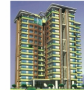
Khushal Heritage Tower, Dattpada Road, Borivali East (2009-2012)