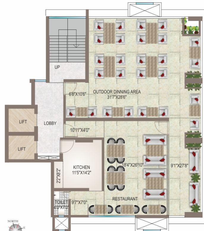
THIRTEEN FLOOR PLAN