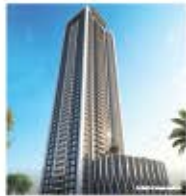
RUNWAL ZENITH, THANE