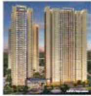
RUNWAL THE CENTRAL PARK, BUNE