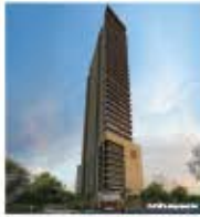
THE RESIDENCE, NEPEAN SEA ROAD