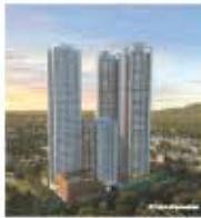
RUNWAL SANCTUARY, MULUND