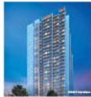
RUNWAL TIMELINE, WADALA