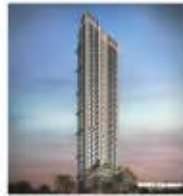
RUNWAL NIRVANA, PAREL