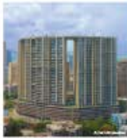
RUNWAL ELEGANTE, LOKHANDWALA