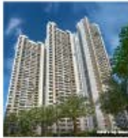
RUNWAL ERENE, THANE