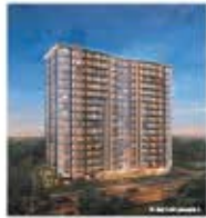
CODENAME RARE, OFF JIJHU CIRCLE, ANDHERI (W)