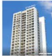
CODENAME ENCHANTED, THANE