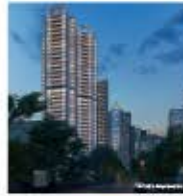
RUNWAL THE RESERVE, WORLI