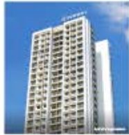
RUNWAL DAHLIA, THANE (WEST)