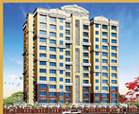
RASSAZ ENCLAVE, MIRA ROAD