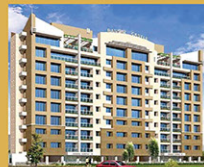
RASSAZ CASTLE, ANDHERI