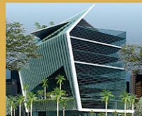
RASSAZ TRADE CENTER, OSHIWARA.