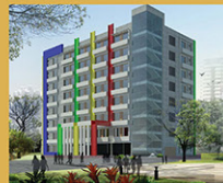
RASSAZ INTERNATIONAL SCHOOL, MIRA ROAD