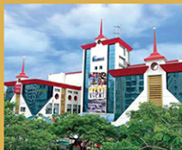
RASSAZ MALL, MIRA ROAD