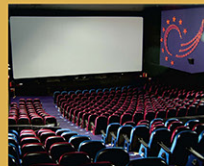
RASSAZ MULTIPLEX, MIRA ROAD