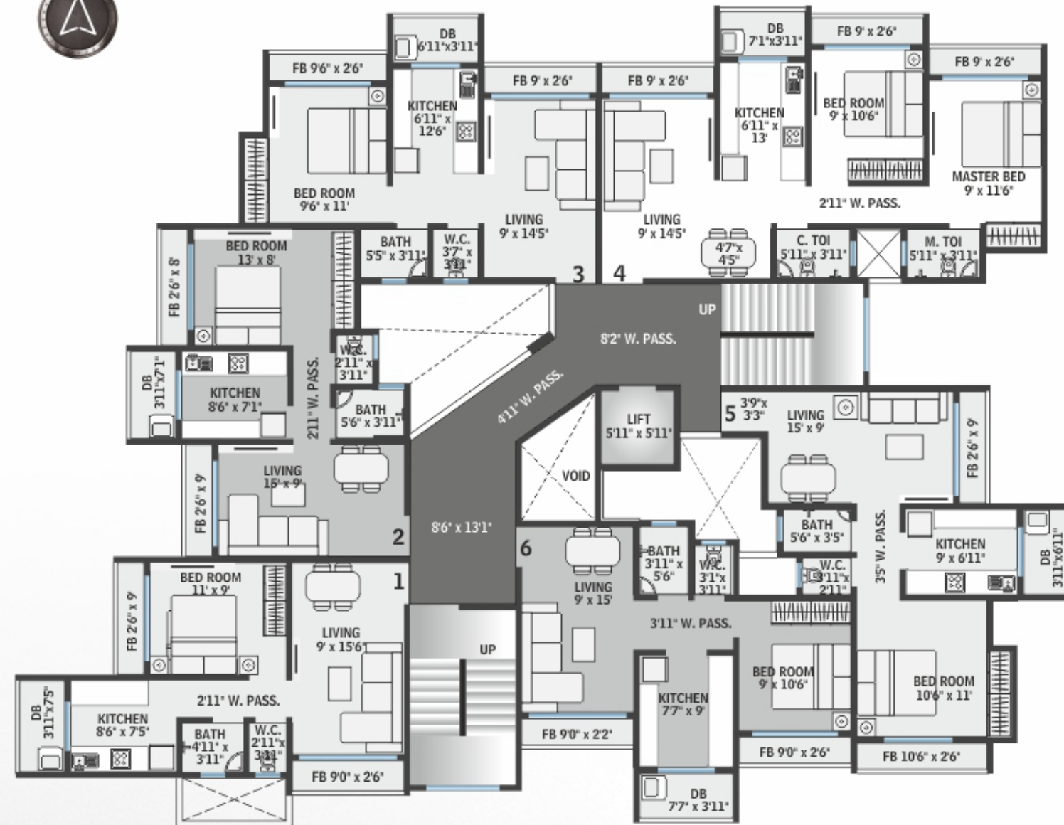
1st - 7th Floor Plan