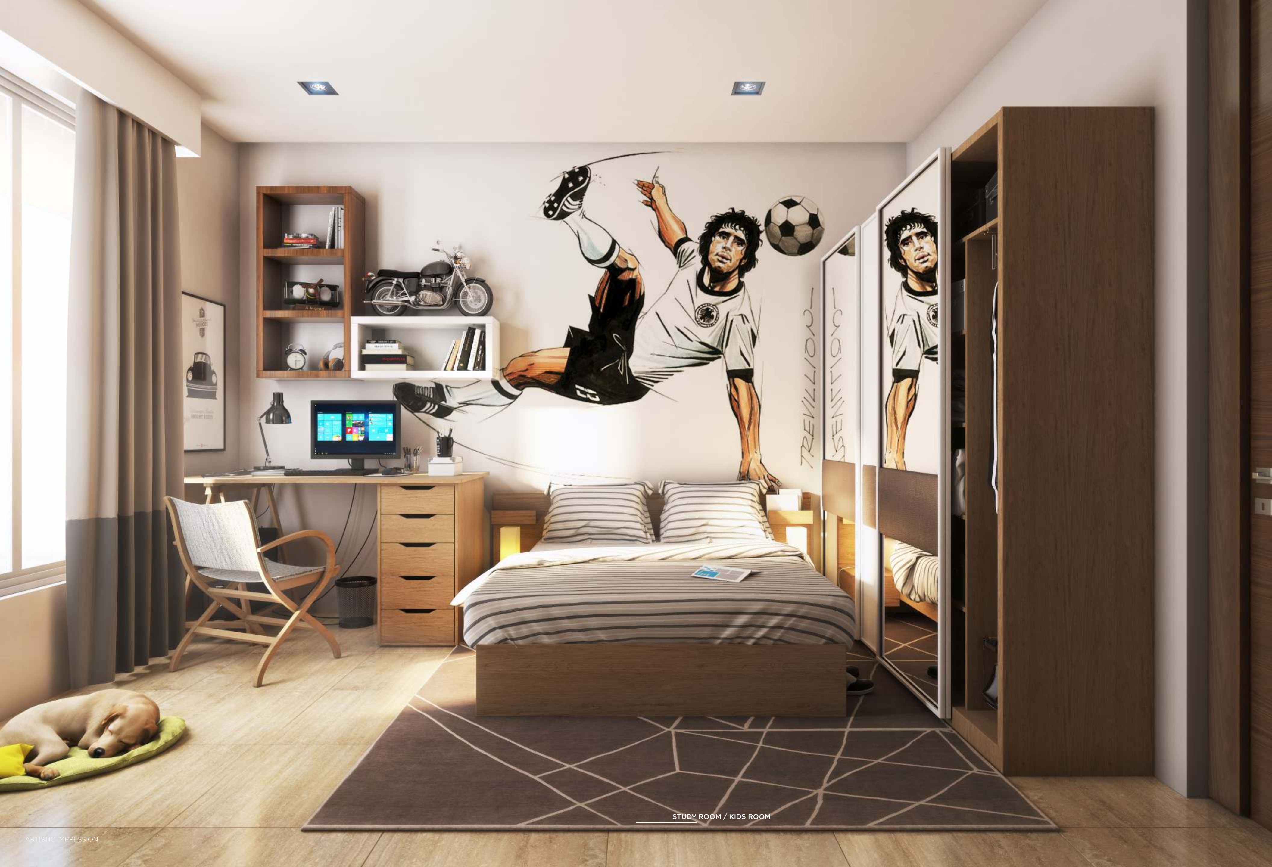
STUDY ROOM / KIDS ROOM