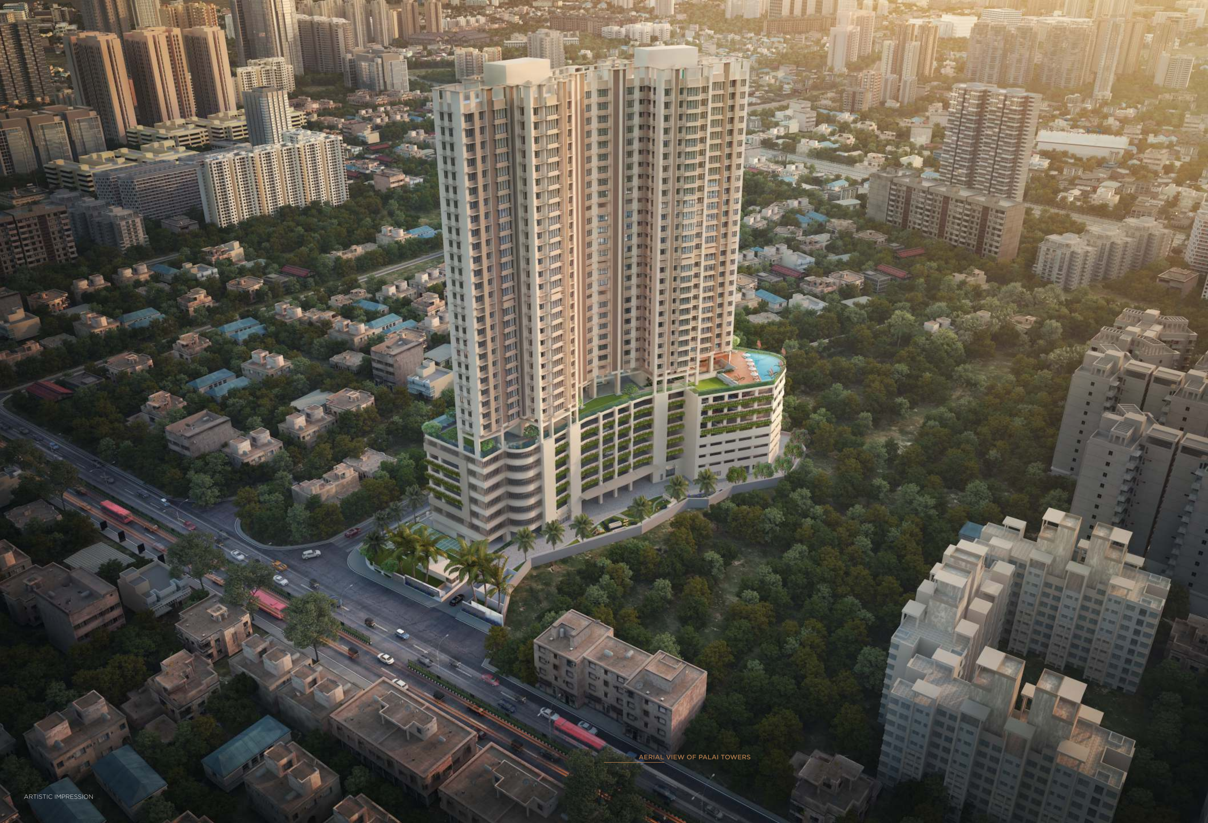
AERIAL VIEW OF PALAI TOWERS