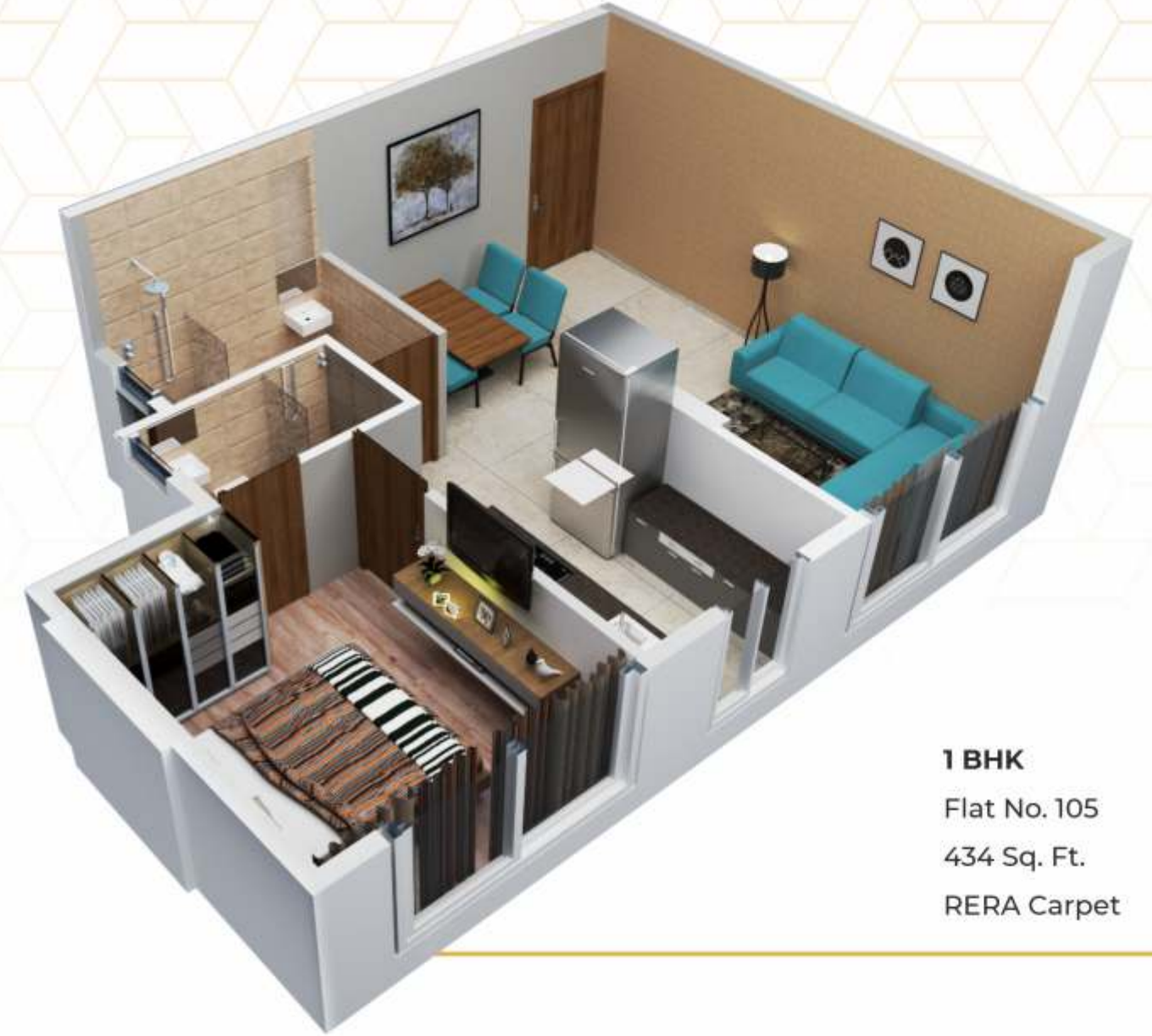
1 BHK Flat No. 105 434 Sq. Ft. RERA Carpet