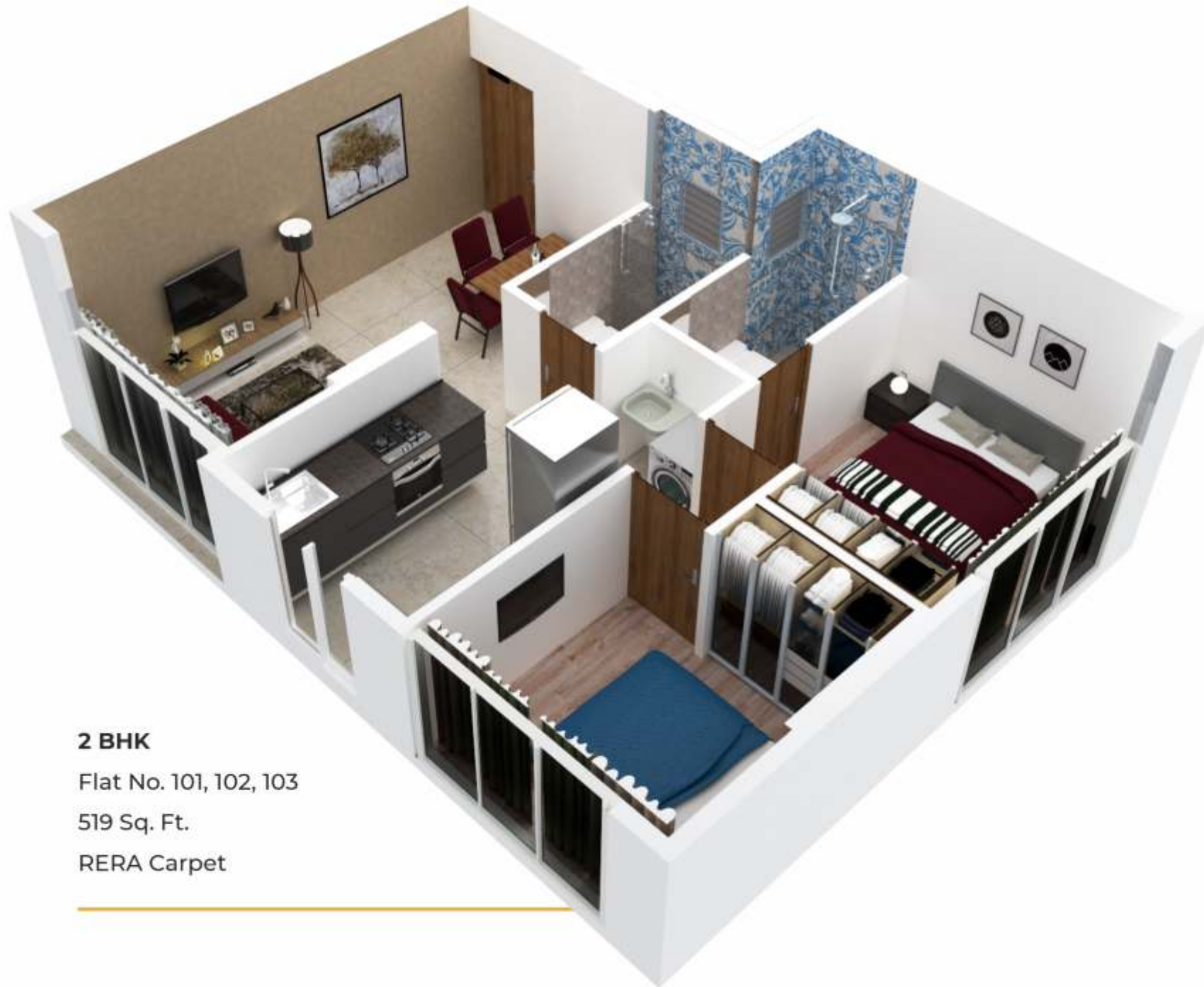
2 BHK Flat No. 101, 102, 103 519 Sq. Ft. RERA Carpet