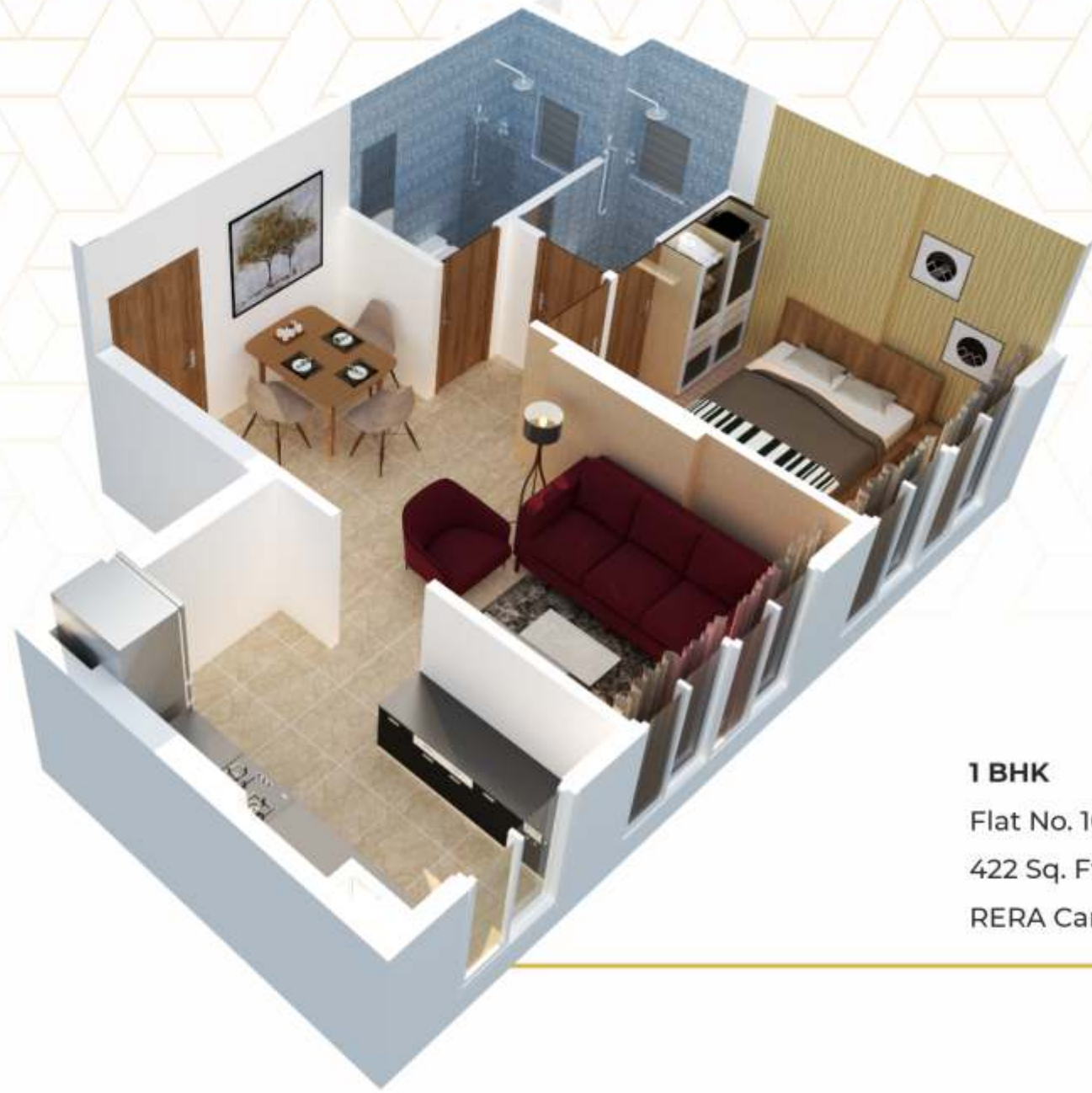
1 BHK Flat No. 104 422 Sq. Ft. RERA Carpet