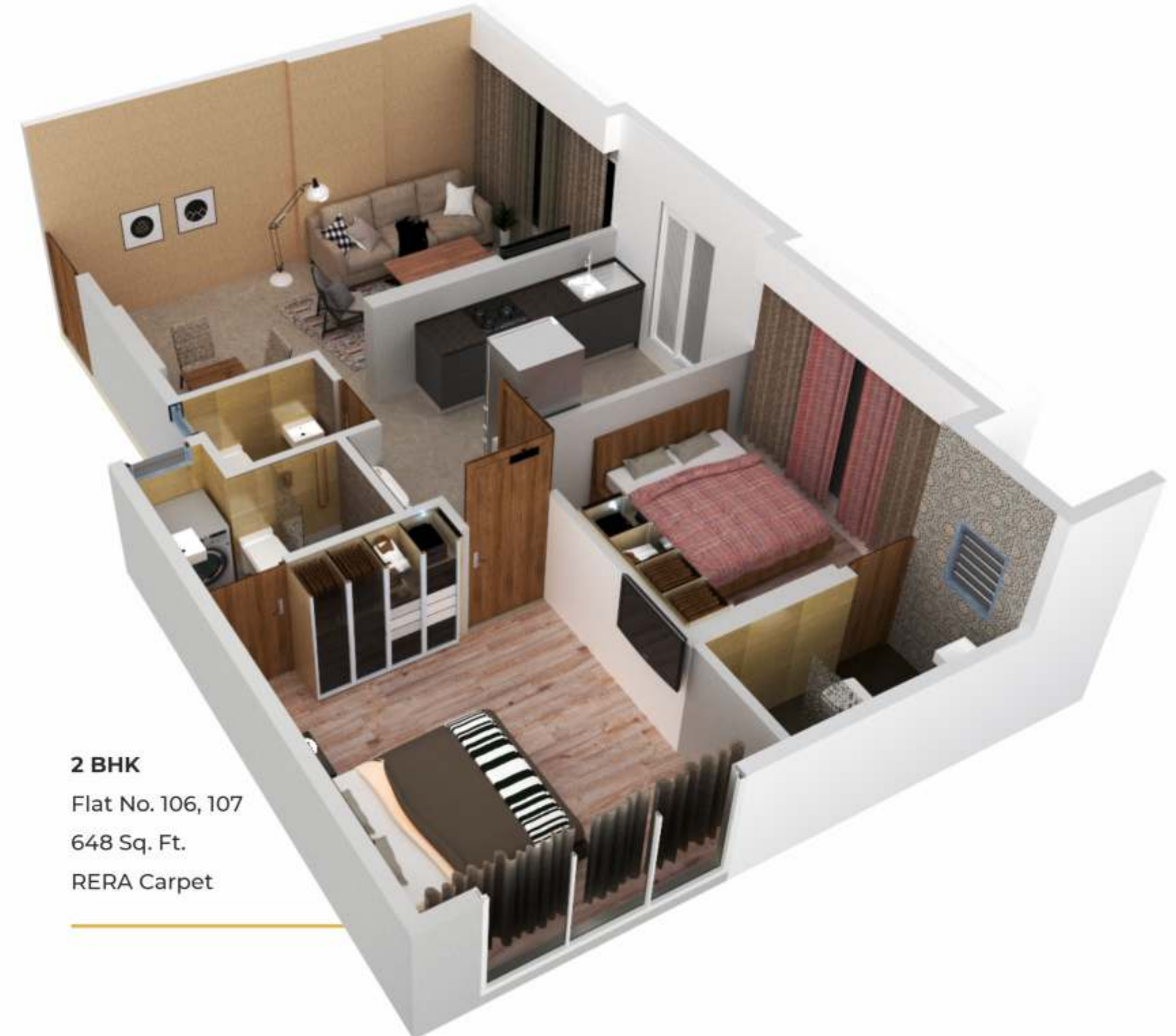
2 BHK Flat No. 106, 107 648 Sq. Ft. RERA Carpet