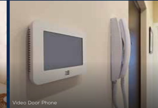
Video Door Phone