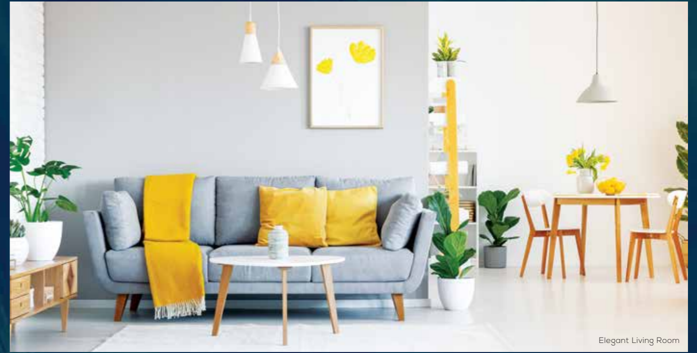
Elegant Living Room