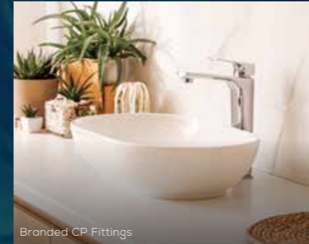
Branded CP Fittings