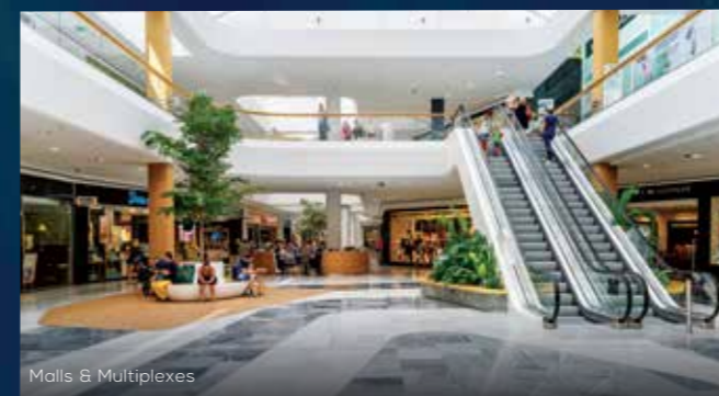
Malls & Multiplexes