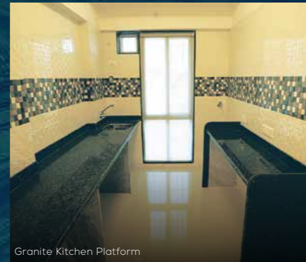
Granite Kitchen Platform