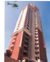
MARATHON HEIGHTS 1997