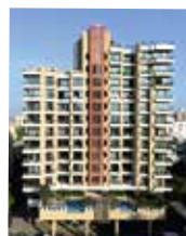
MARATHON ONYX 2012