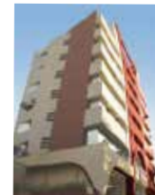
MARATHON CHAMBERS 2004