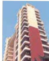
MARATHON GALAXY 1996