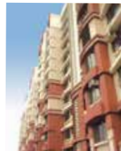
MARATHON COSMOS 2001