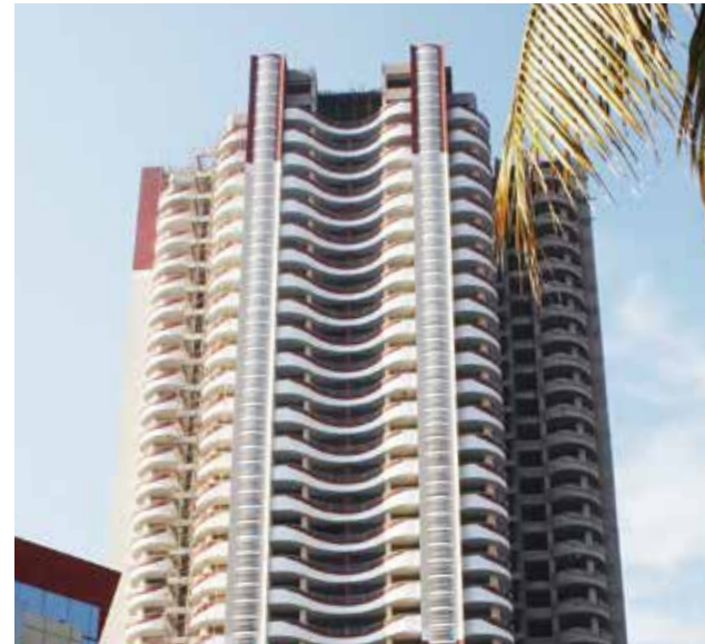
Actual Photo 2006