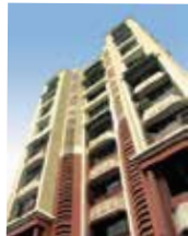
MOUNT VIEW 1996