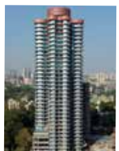
MARATHON MONTE VISTA 2013