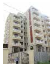
MARATHON NAGARI-NX 2014