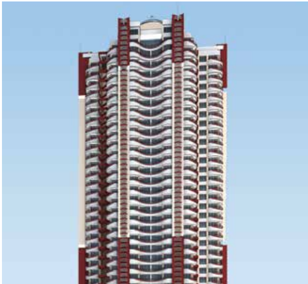
Artist's Impression 2004