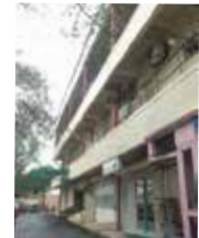
UDYOG KSHETRA 1997