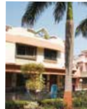
VIRAYATAN (DEOLALI) 1996