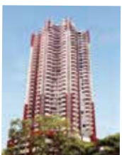
MARATHON NEXTGEN ERA 2006