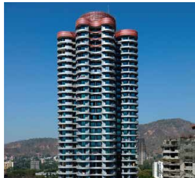
Actual Photo 2013