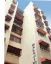
TIRUPATI & BALAJI 1982