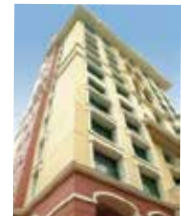
MARATHON OMEGA 2005