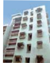
RITA APARTMENTS 1979