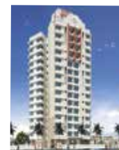
MARATHON EMBRYO 2015