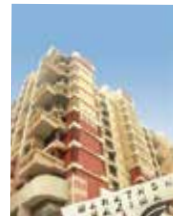
MARATHON MAXIMA 2003