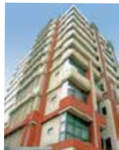
MARATHON MAX 2003