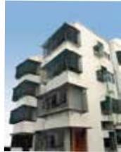
MAHAVIR DHAM 1977