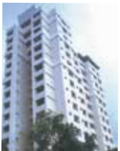
MARATHON HERITAGE 1999