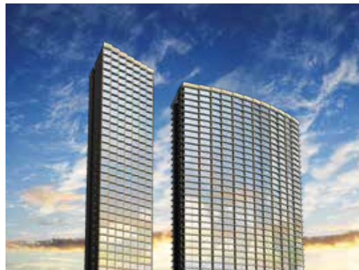
Nexworld , Dombivali (E)