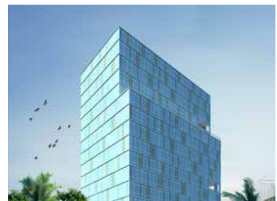
Icon , Lower Parel