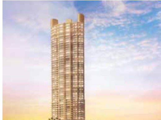
Monte Carlo , Mulund (W)