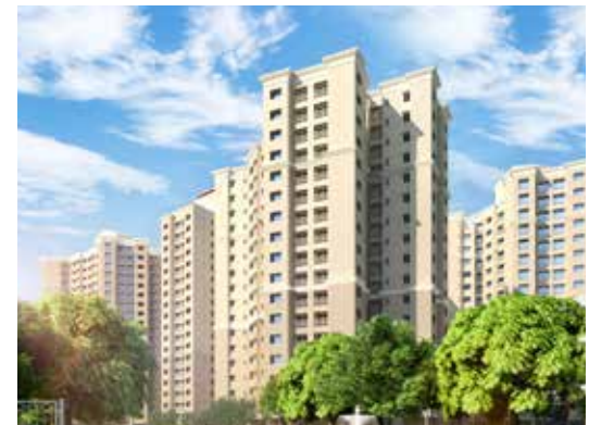
Nextown , Kalyan-Shill Road