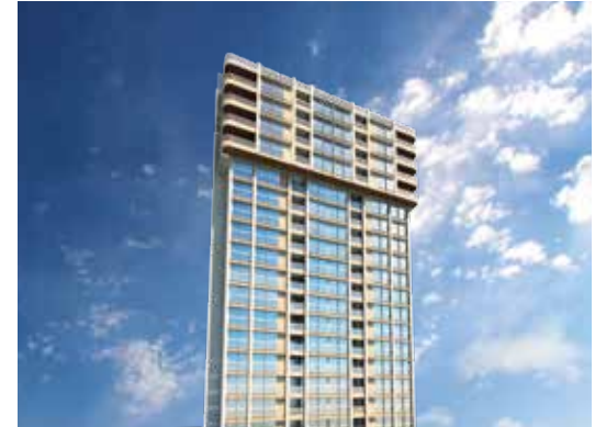
Emblem , Mulund (W)