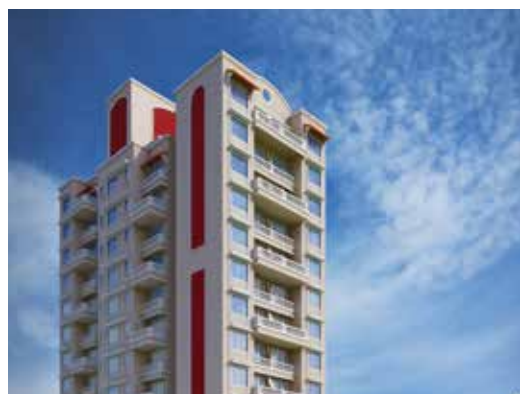
Nagari-NX , Badlapur (E)