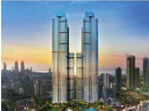
Monte South , Byculla

We are currently building several townships in the fastest growing neighborhoods, affordable housing projects, ultra-luxury skyscrapers, small offices and large business centers, with projects spread across the Mumbai Metropolitan Region (MMR).