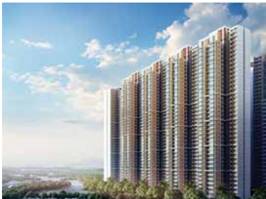
Nexzone , Panvel