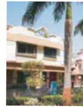
VIRAYATAN (DEOLALI) 1996