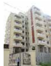
MARATHON NAGARI-NX 2014