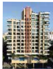
MARATHON ONYX 2012