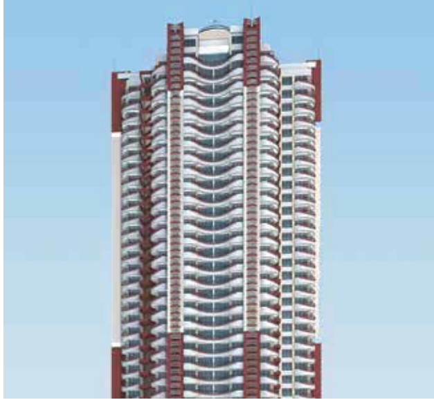
Artist's Impression 2004