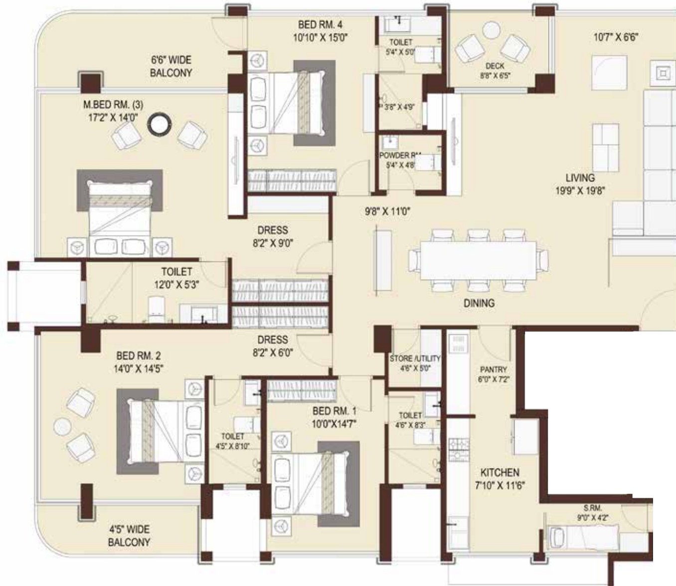
Typical Floor plan 18 th - 21 st floor