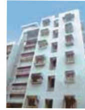
RITA APARTMENTS 1979