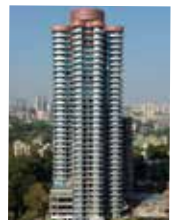
MARATHON MONTE VISTA 2013