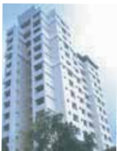
MARATHON HERITAGE 1999