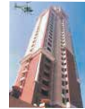
MARATHON HEIGHTS 1997