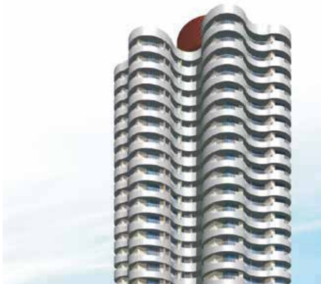
Artist's Impression 2009