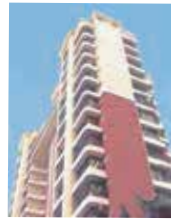
MARATHON GALAXY 1996