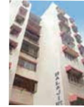
TIRUPATI & BALAJI 1982