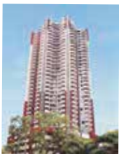
MARATHON NEXTGEN ERA 2006