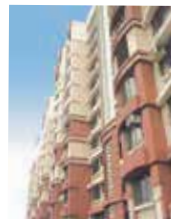
MARATHON COSMOS 2001