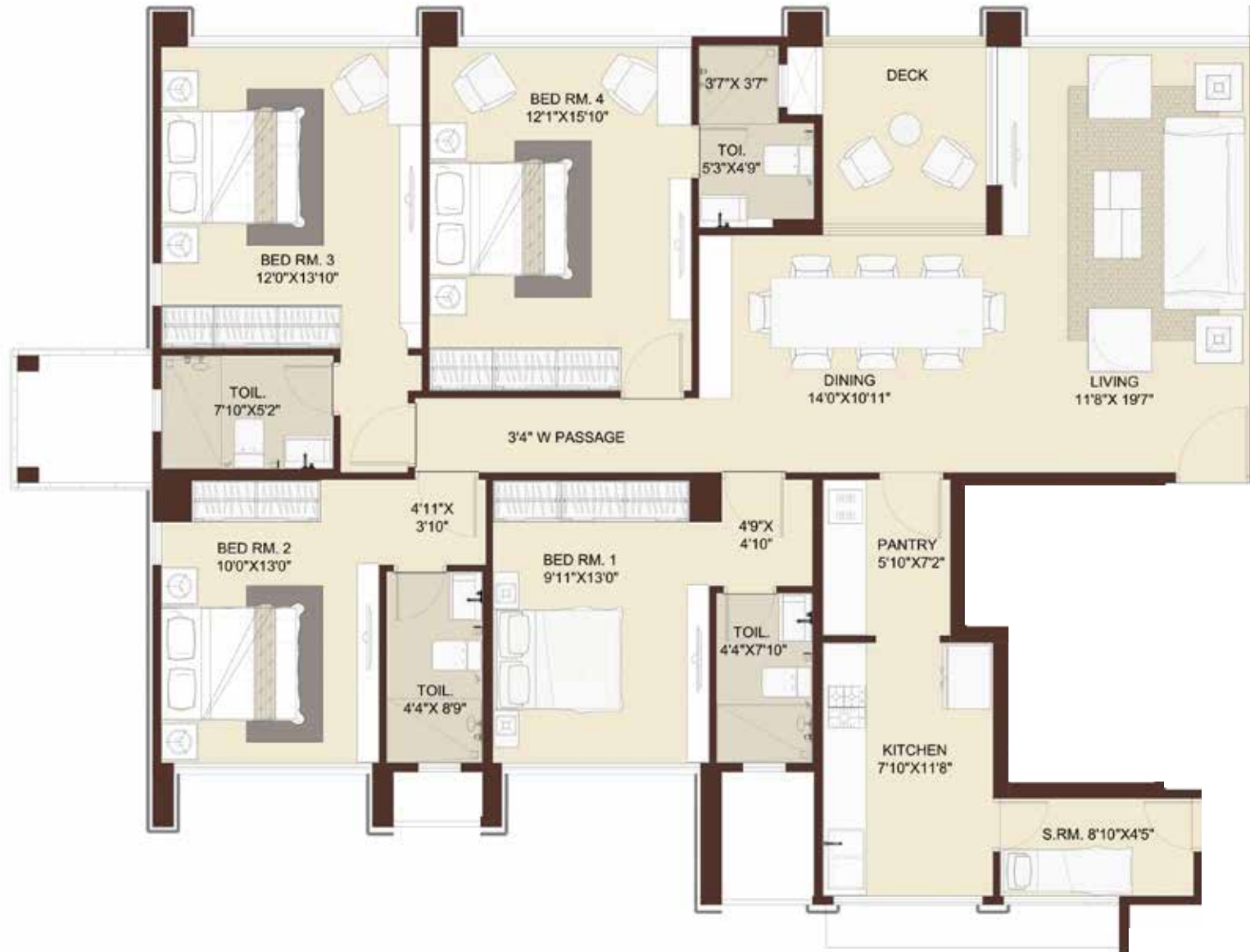
Typical Floor plan 5 th - 15 th floor & 17 th floor