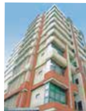
MARATHON MAX 2003