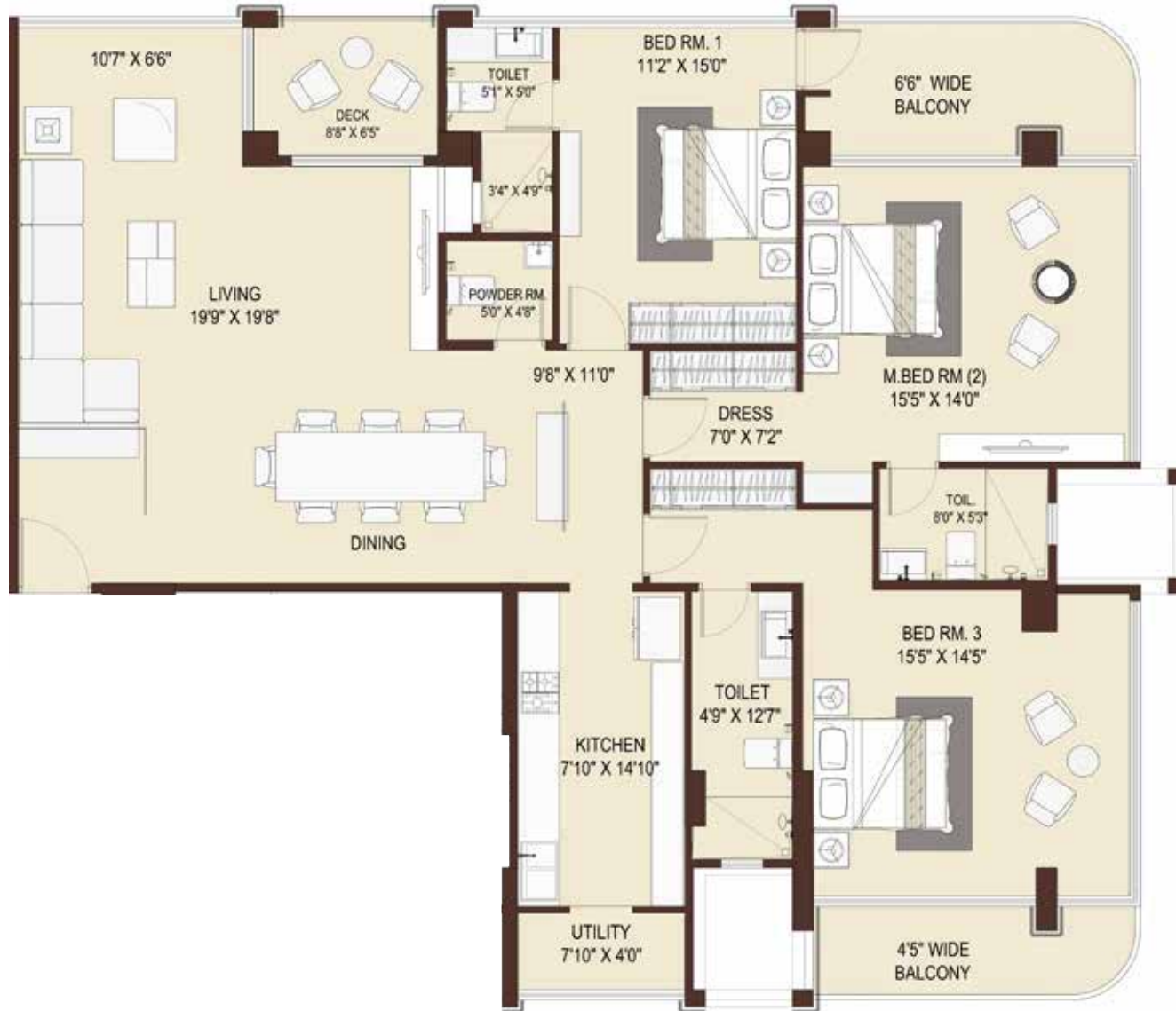
Typical Floor plan 18 th - 21 st floor