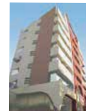
MARATHON CHAMBERS 2004