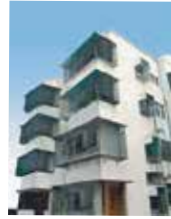
MAHAVIR DHAM 1977