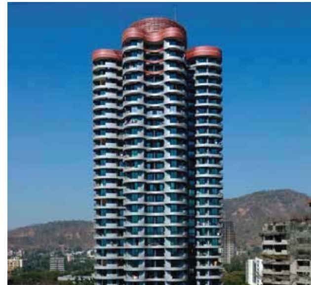
Actual Photo 2013