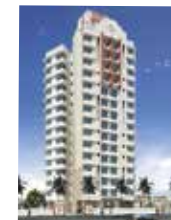
MARATHON EMBRYO 2015