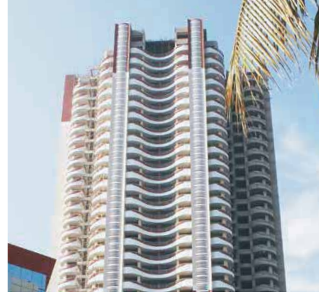
Actual Photo 2006