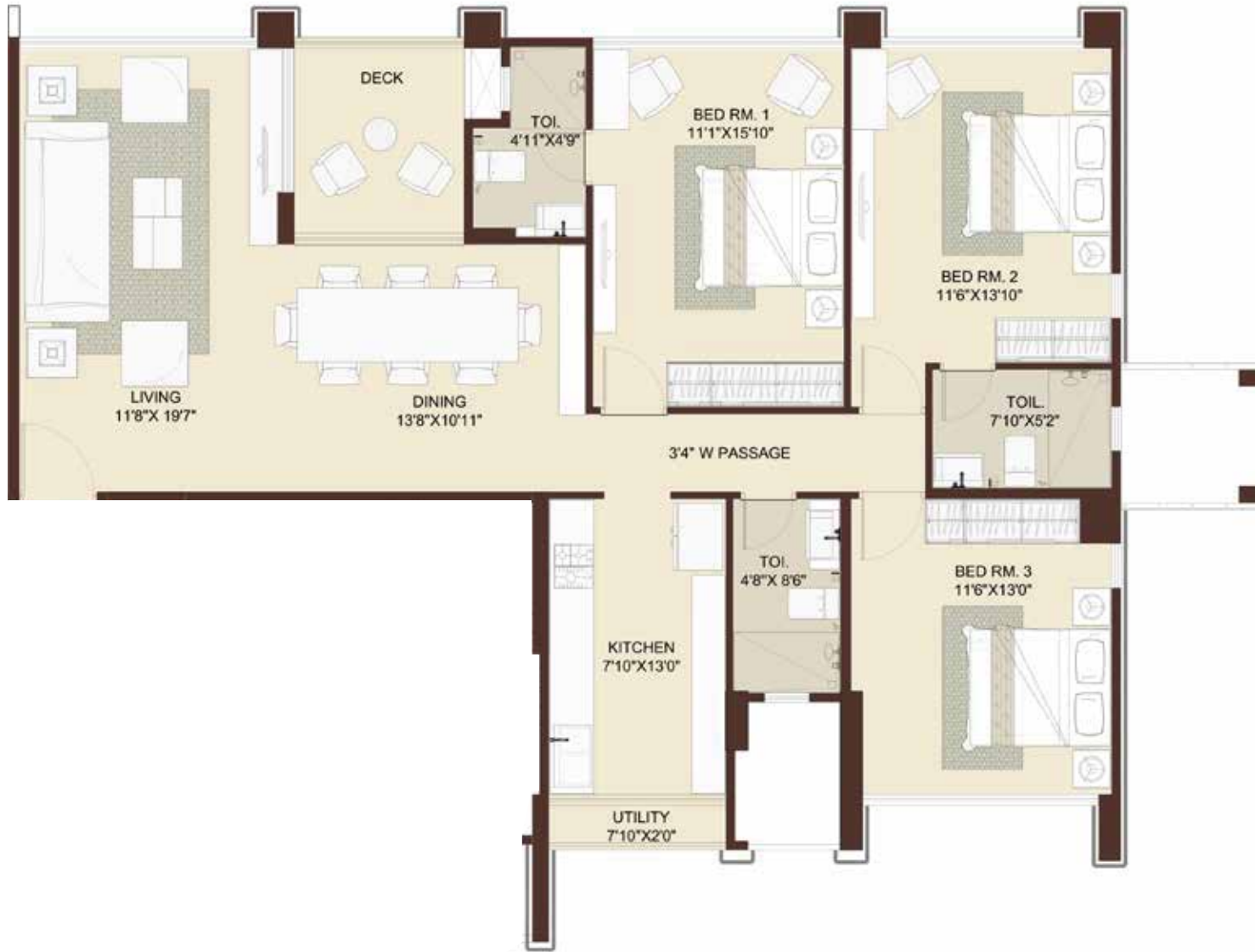
Typical Floor plan 5 th - 15 th floor & 17 th floor