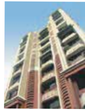
MOUNT VIEW 1996