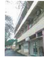
UDYOG KSHETRA 1997