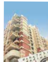
MARATHON MAXIMA 2003