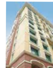
MARATHON OMEGA 2005