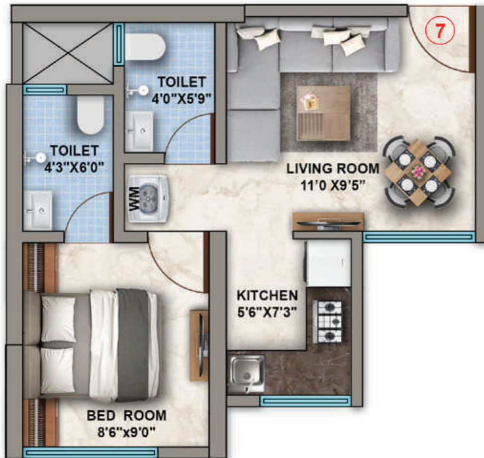
FLOOR PLAN - 1 BHK