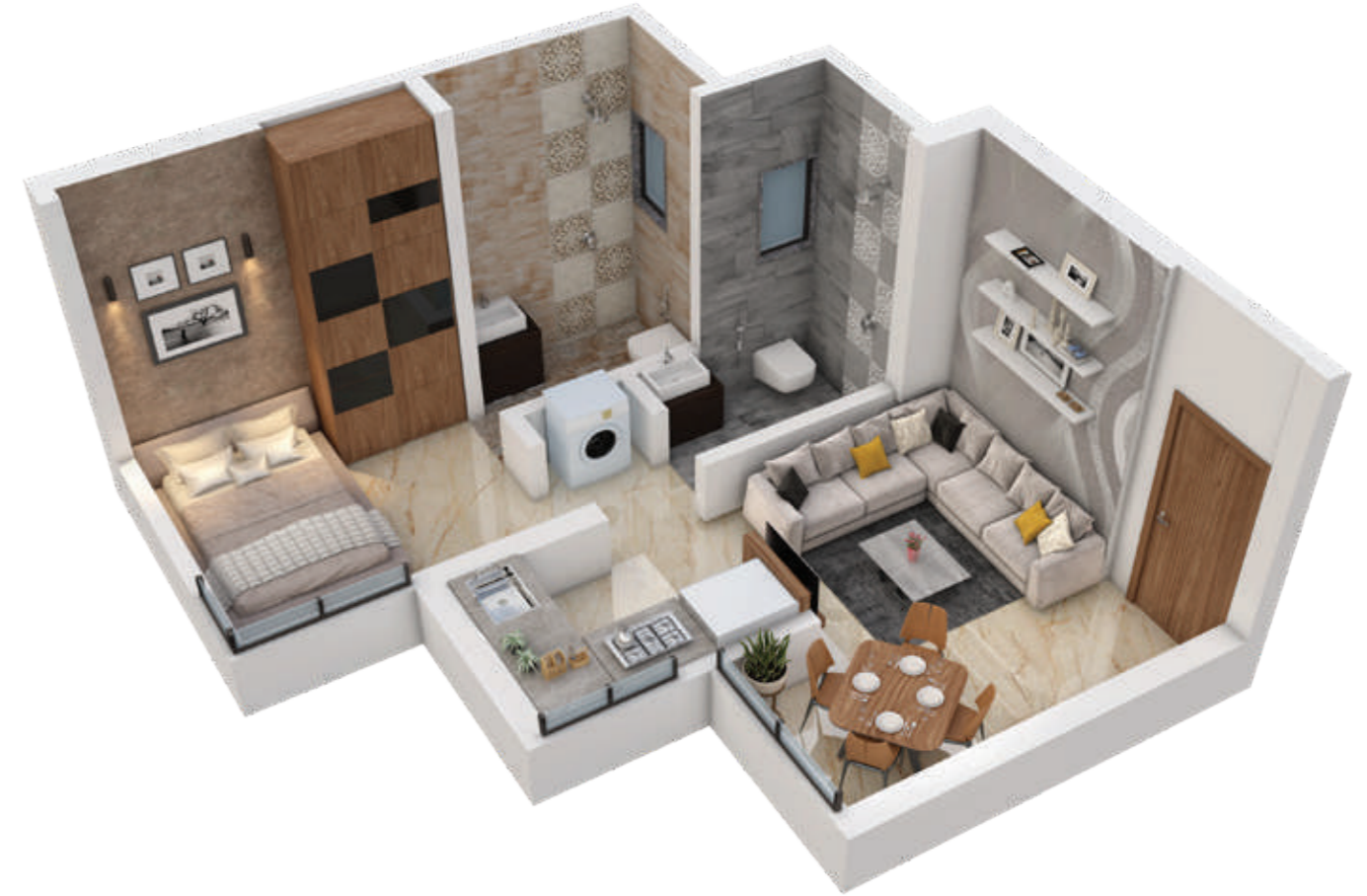
FLOOR PLAN - 1 BHK