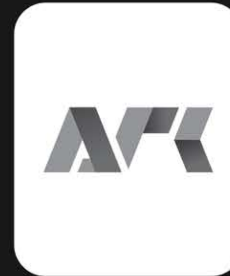
PRINCIPAL ARCHITECTS ARK Reza Kabul Architects