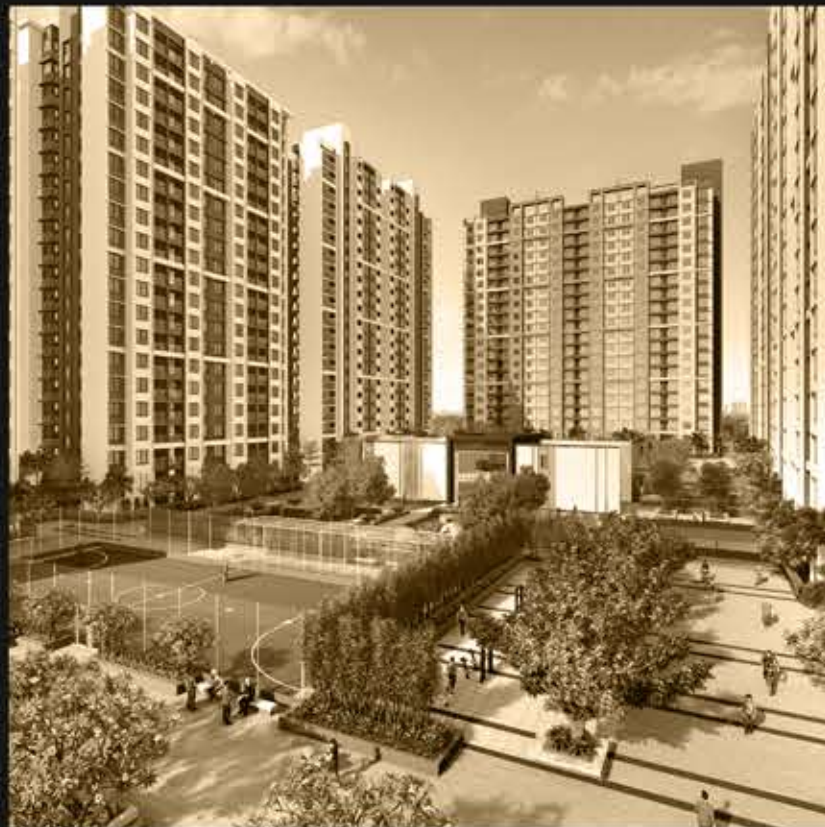
LIFE REPUBLIC (PUNE)