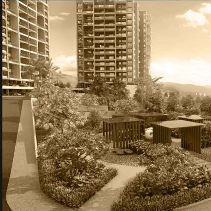
24K STARGAZE (PUNE)