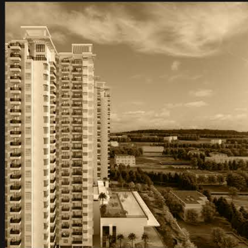
I-TOWERS EXENTE (BENGALURU)