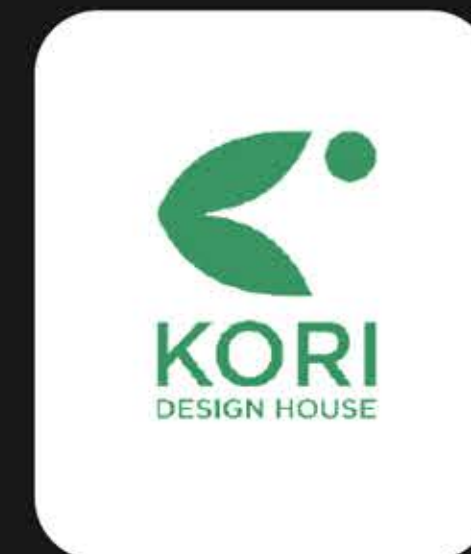
LANDSCAPE PARTNERS Kori Design House