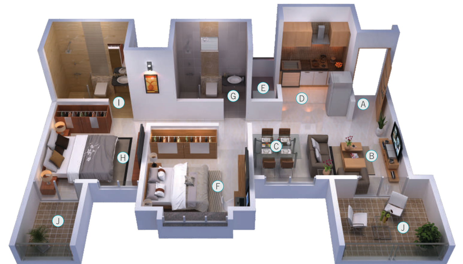
2 BHK TYPE 'B'