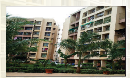
Ritu Pradise - Mira Road (E)