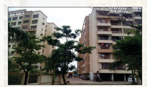
Garden Court - Bhayander (W)