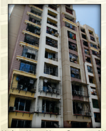
Vedant, Unnat Nagar Goregaon (W)