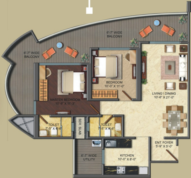
2BHK - TYPE 2