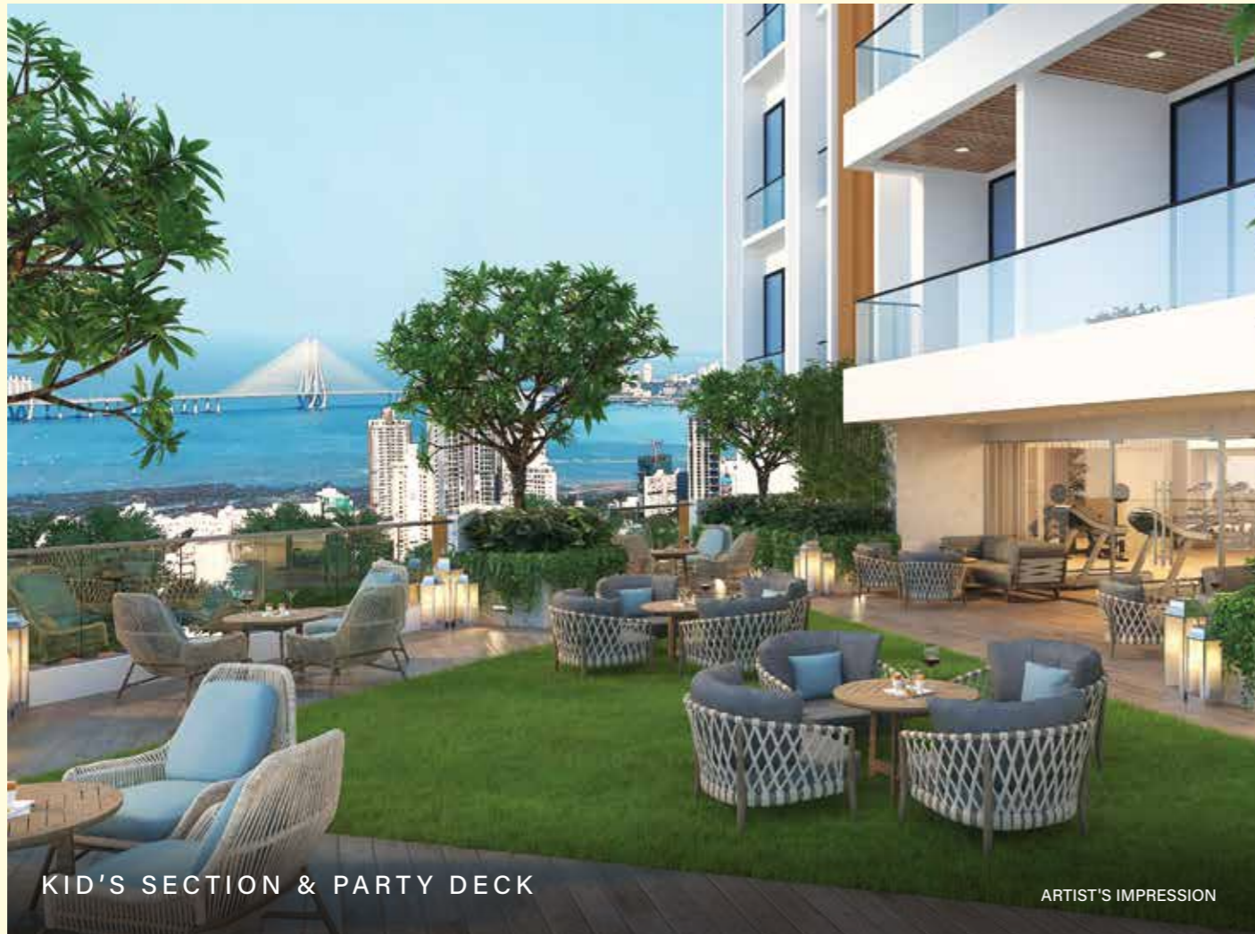
KID'S SECTION & PARTY DECK