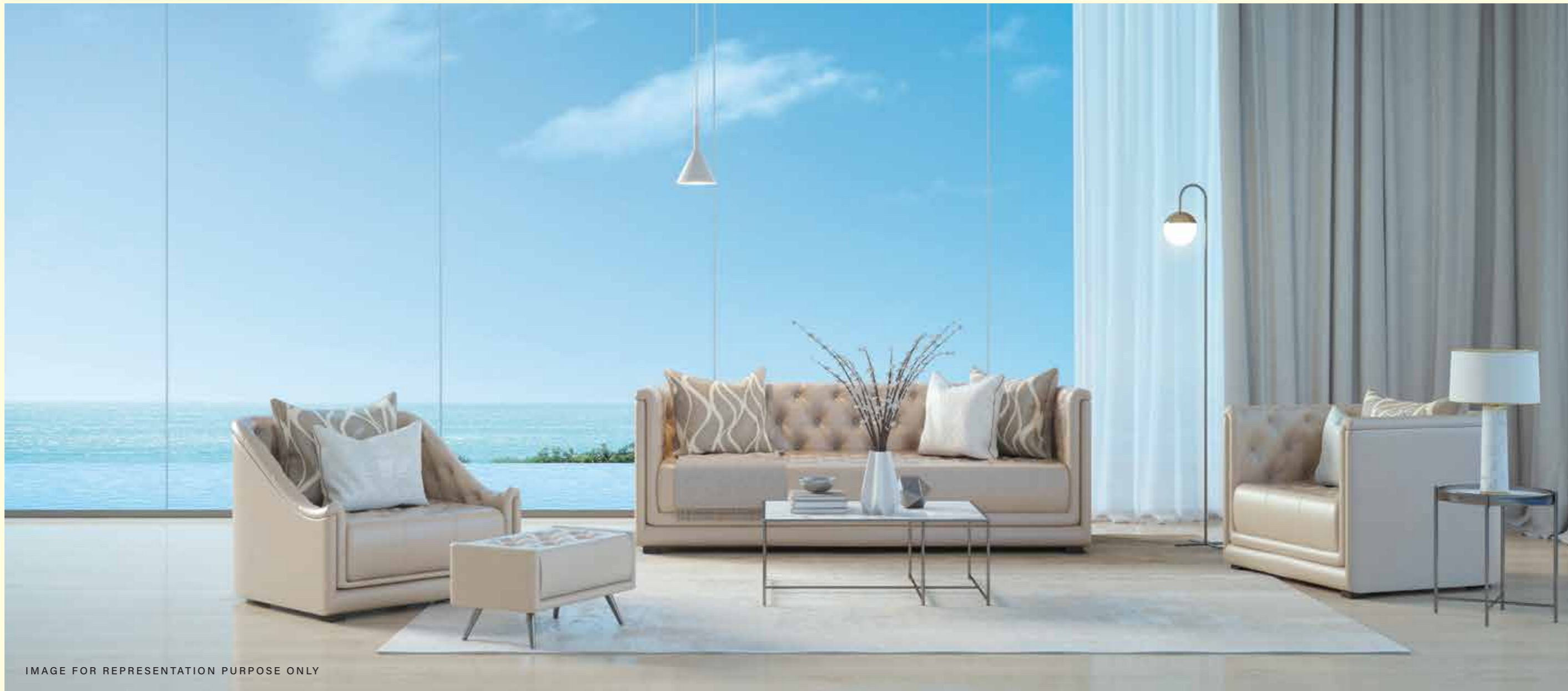
IMAGE FOR REPRESENTATION PURPOSE ONLY