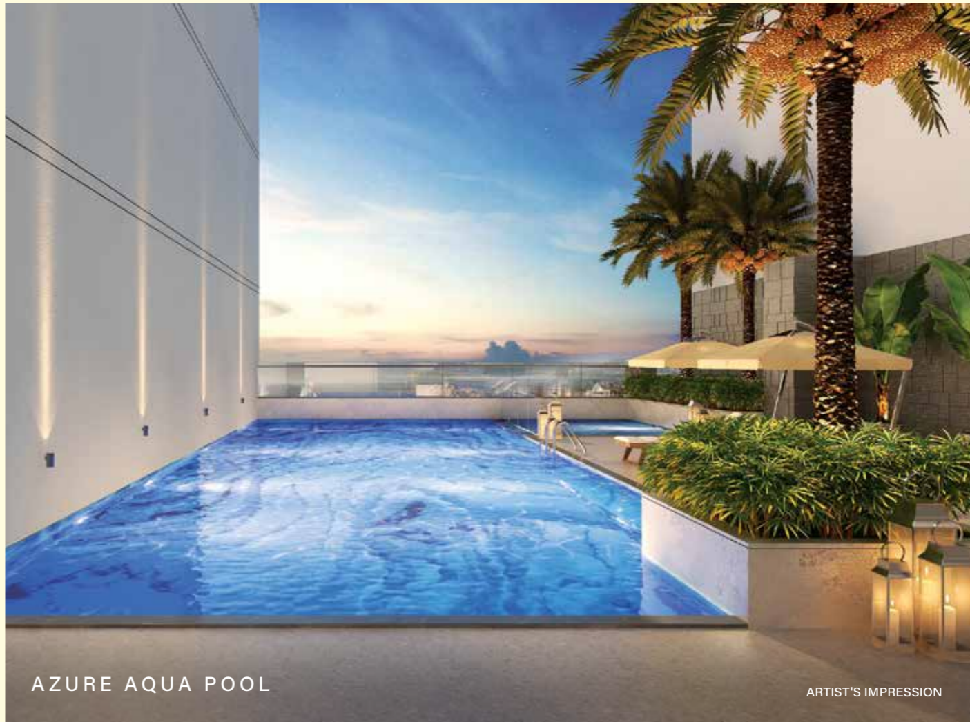
AZURE AQUA POOL