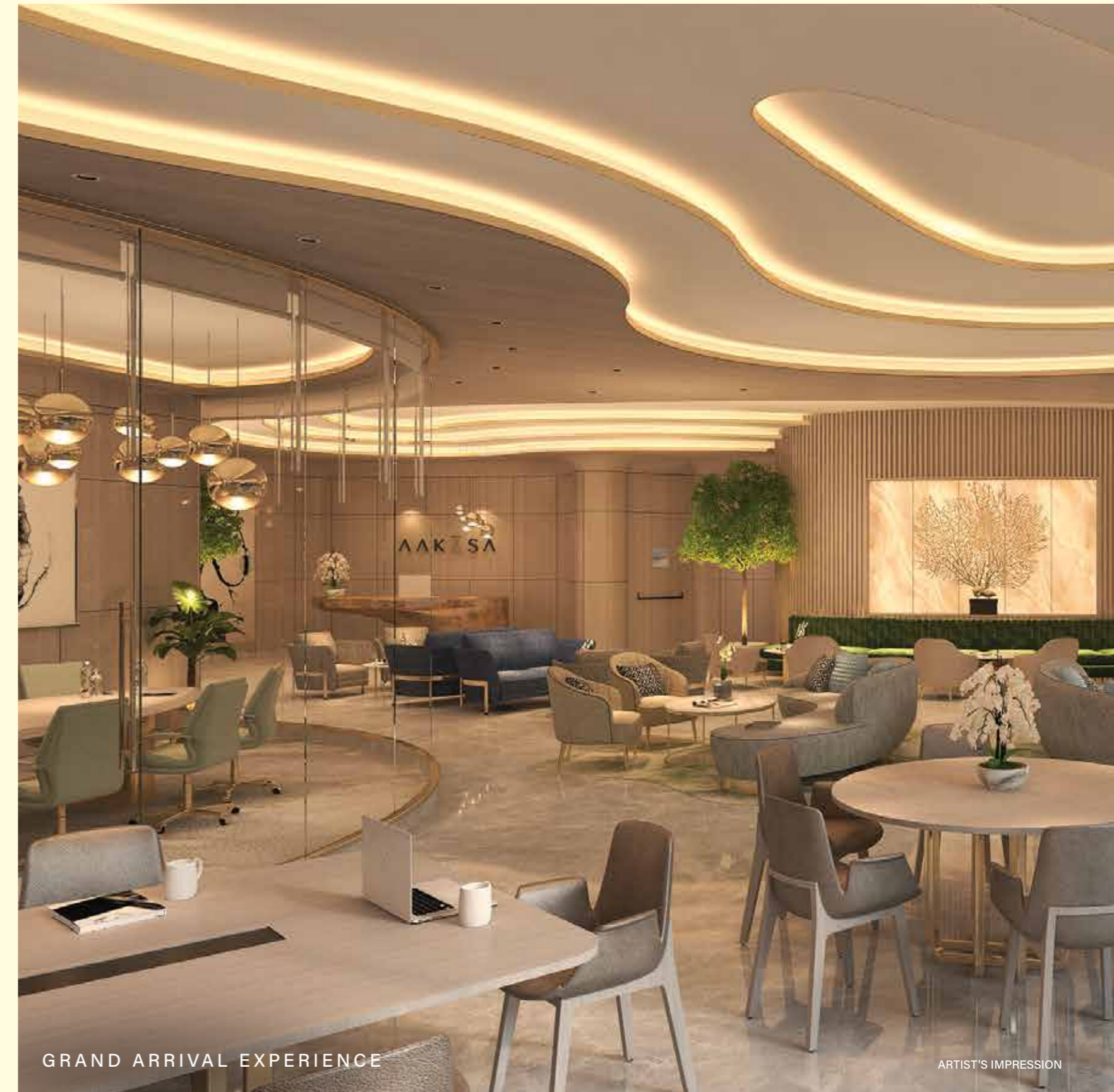
GRAND ARRIVAL EXPERIENCE