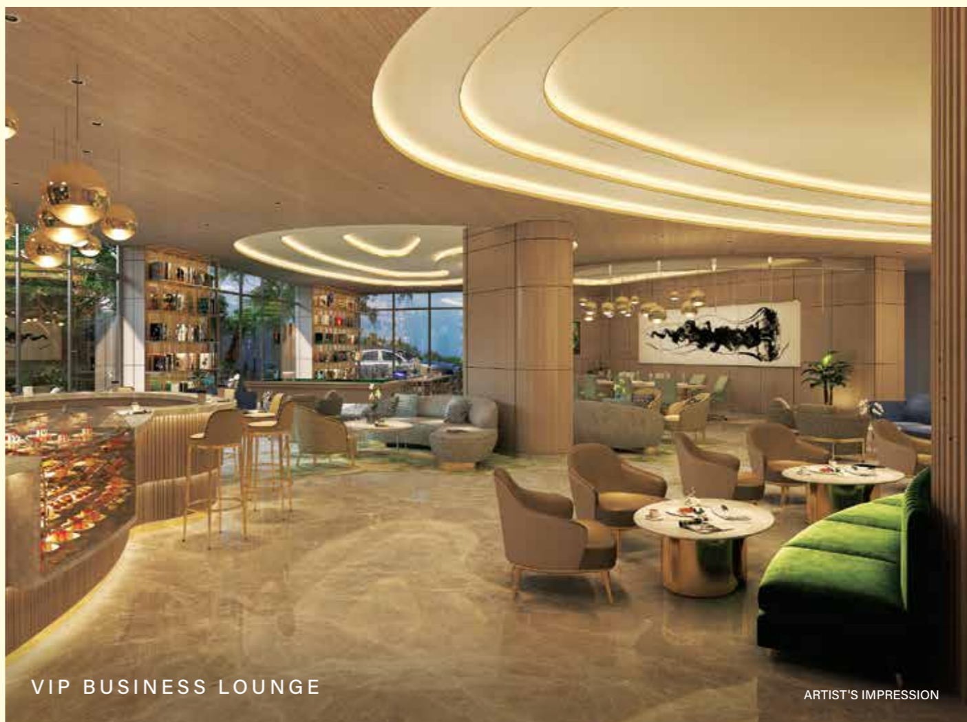
VIP BUSINESS LOUNGE