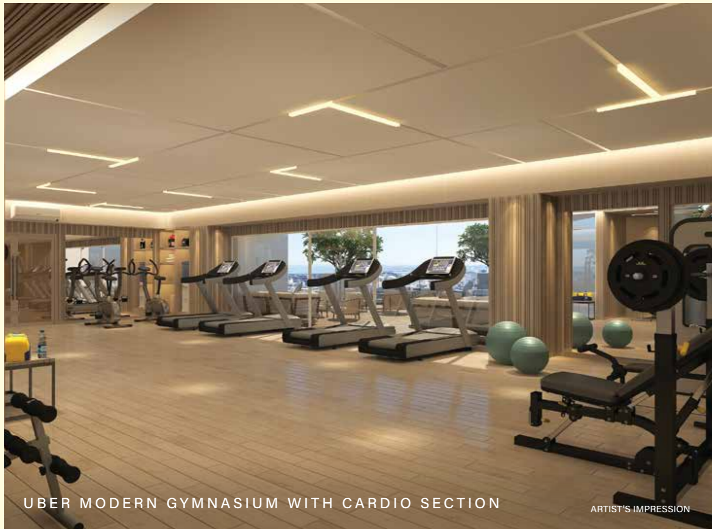
UBER MODERN GYMNASIUM WITH CARDIO SECTION