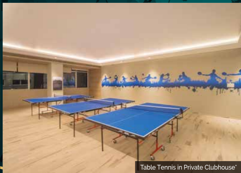
Table Tennis in Private Clubhouse*