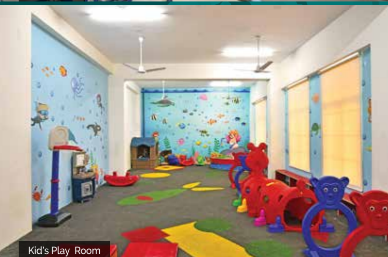
Kid's Play Room