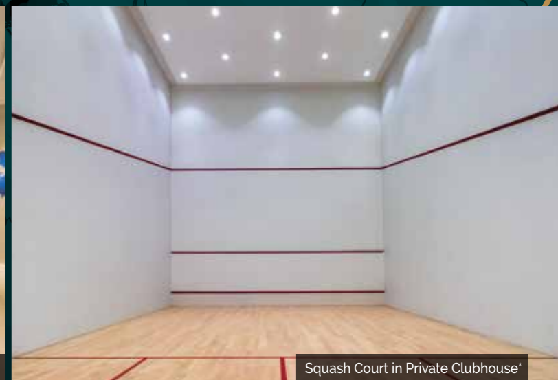
Squash Court in Private Clubhouse*

*Dosti Club Royale is a Private Clubhouse. Right of admission is reserved by the Promoter.