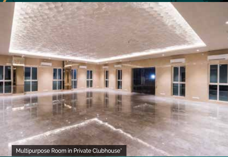
Multipurpose Room in Private Clubhouse*