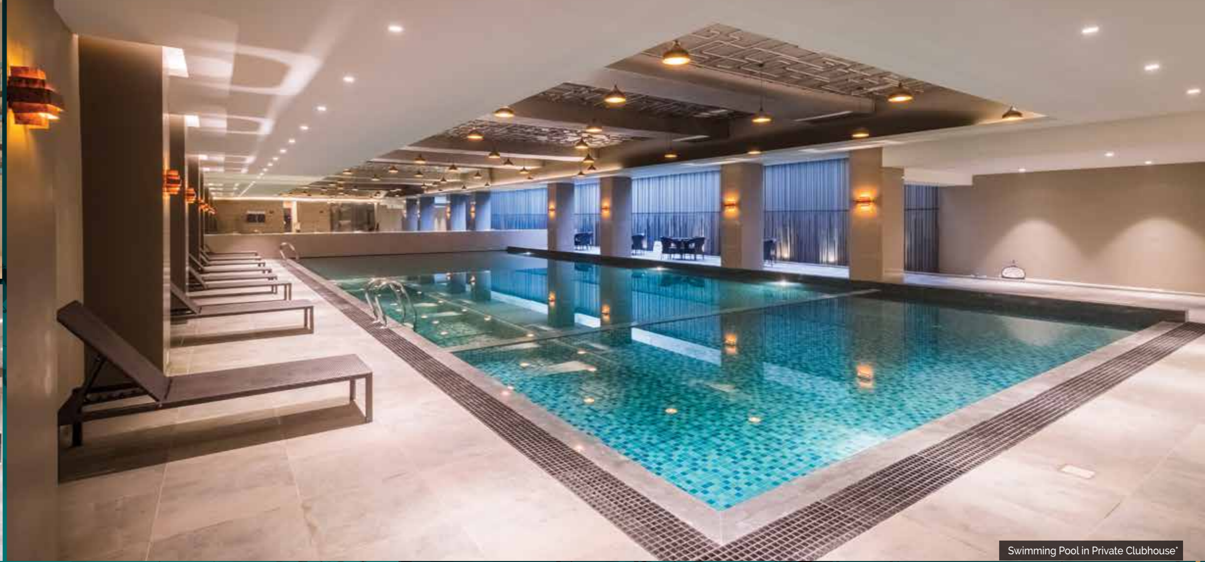
Swimming Pool in Private Clubhouse*