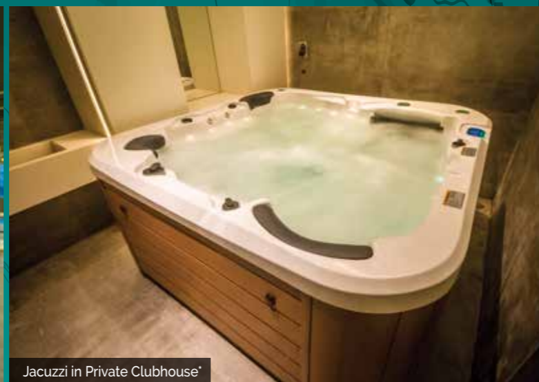
Jacuzzi in Private Clubhouse*