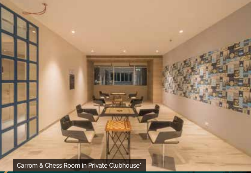
Carrom & Chess Room in Private Clubhouse*