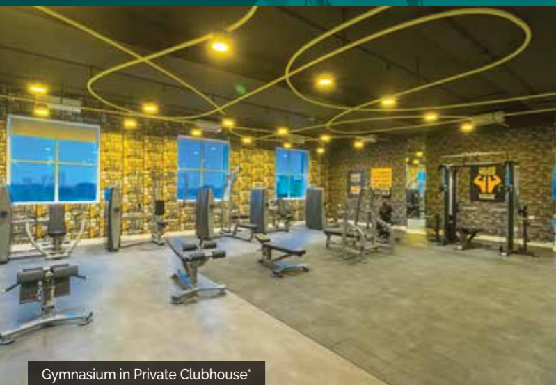
Gymnasium in Private Clubhouse*