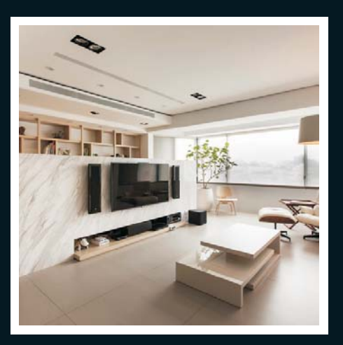
Italian Marble in living room & common area