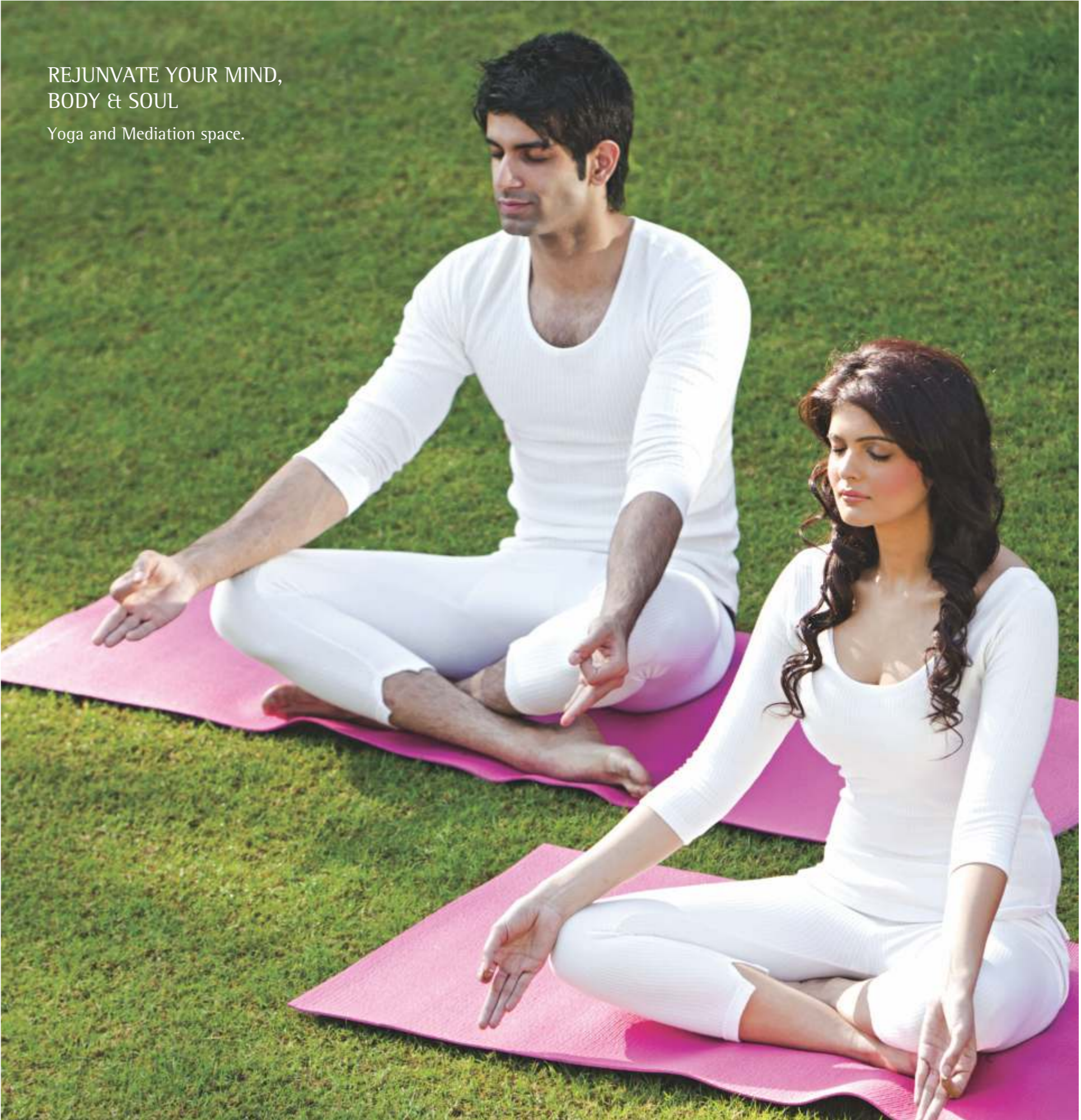
REJUNVATE YOUR MIND, BODY & SOUL Yoga and Mediation space.