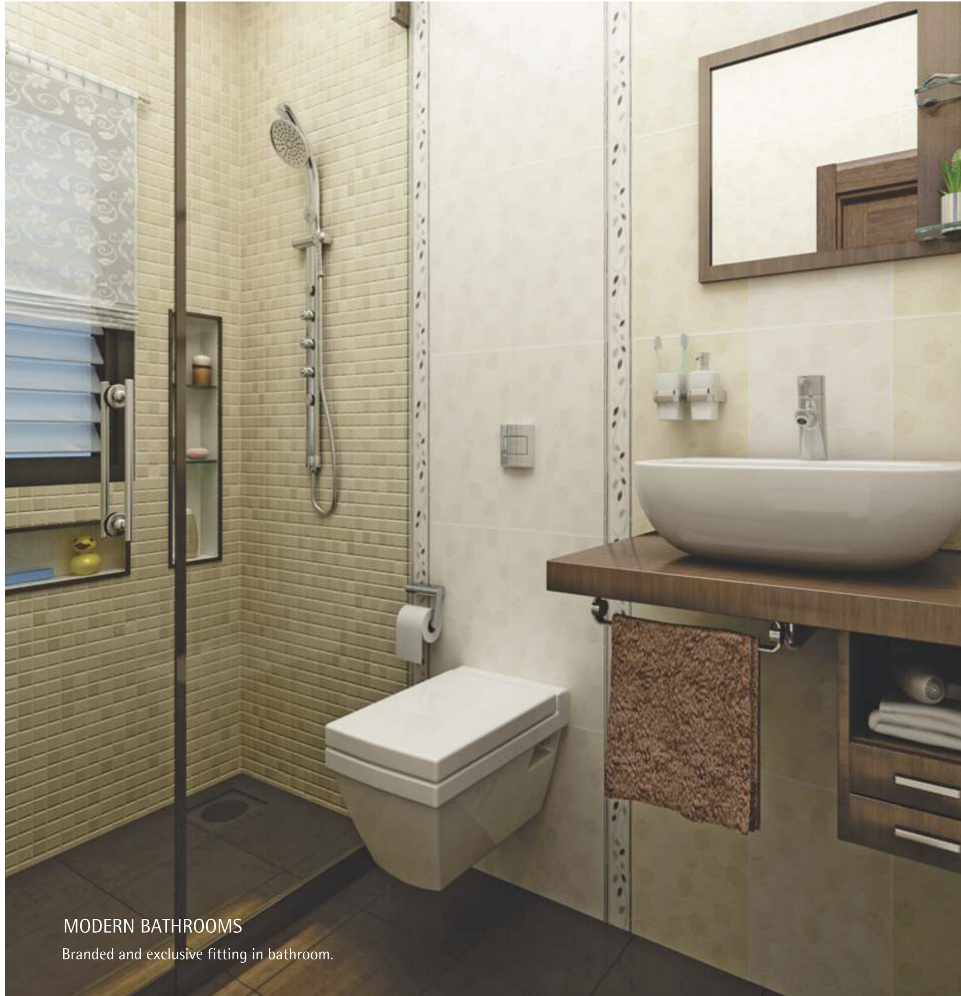
MODERN BATHROOMS Branded and exclusive fitting in bathroom.