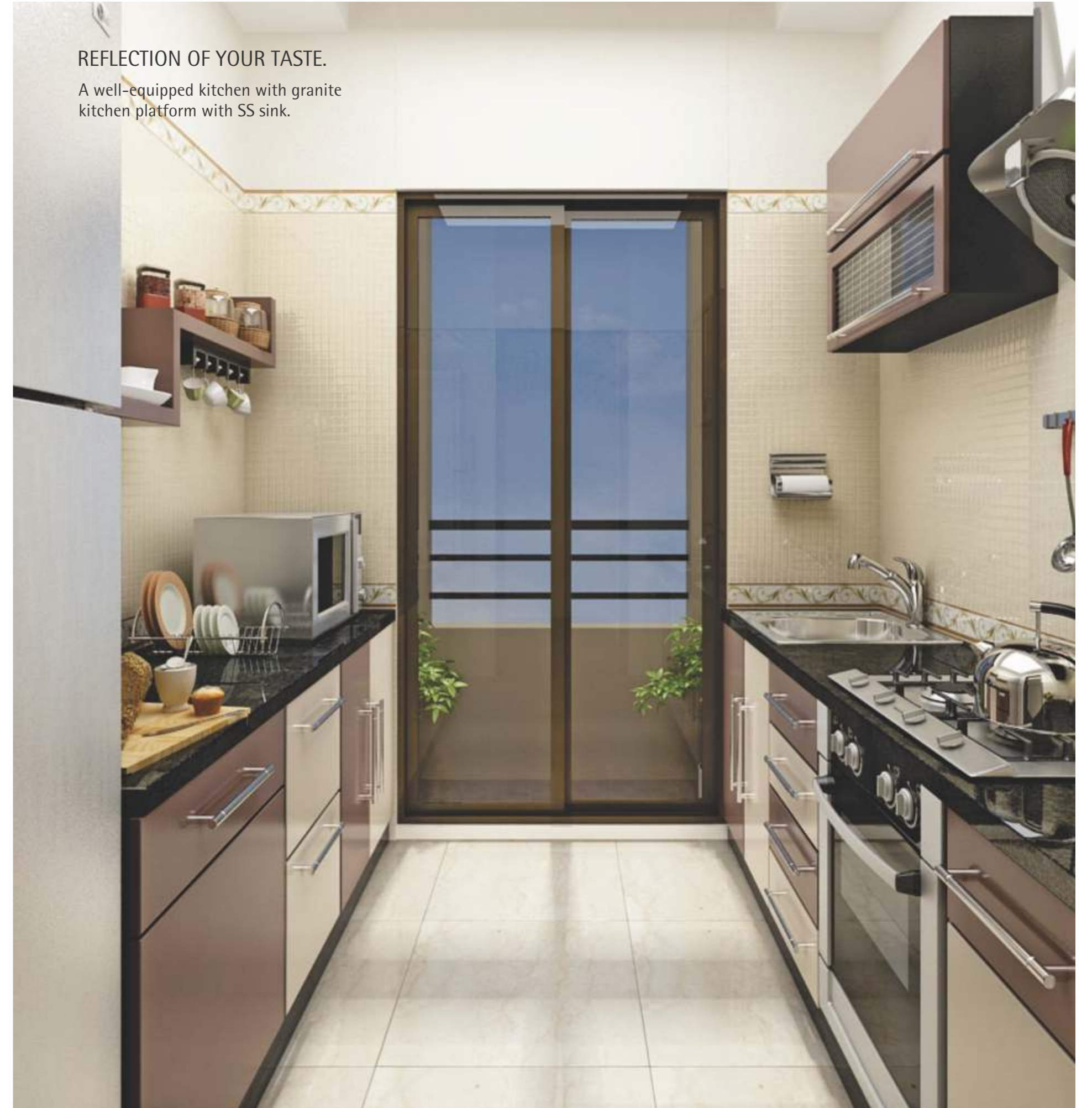
REFLECTION OF YOUR TASTE. A well-equipped kitchen with granite kitchen platform with SS sink.