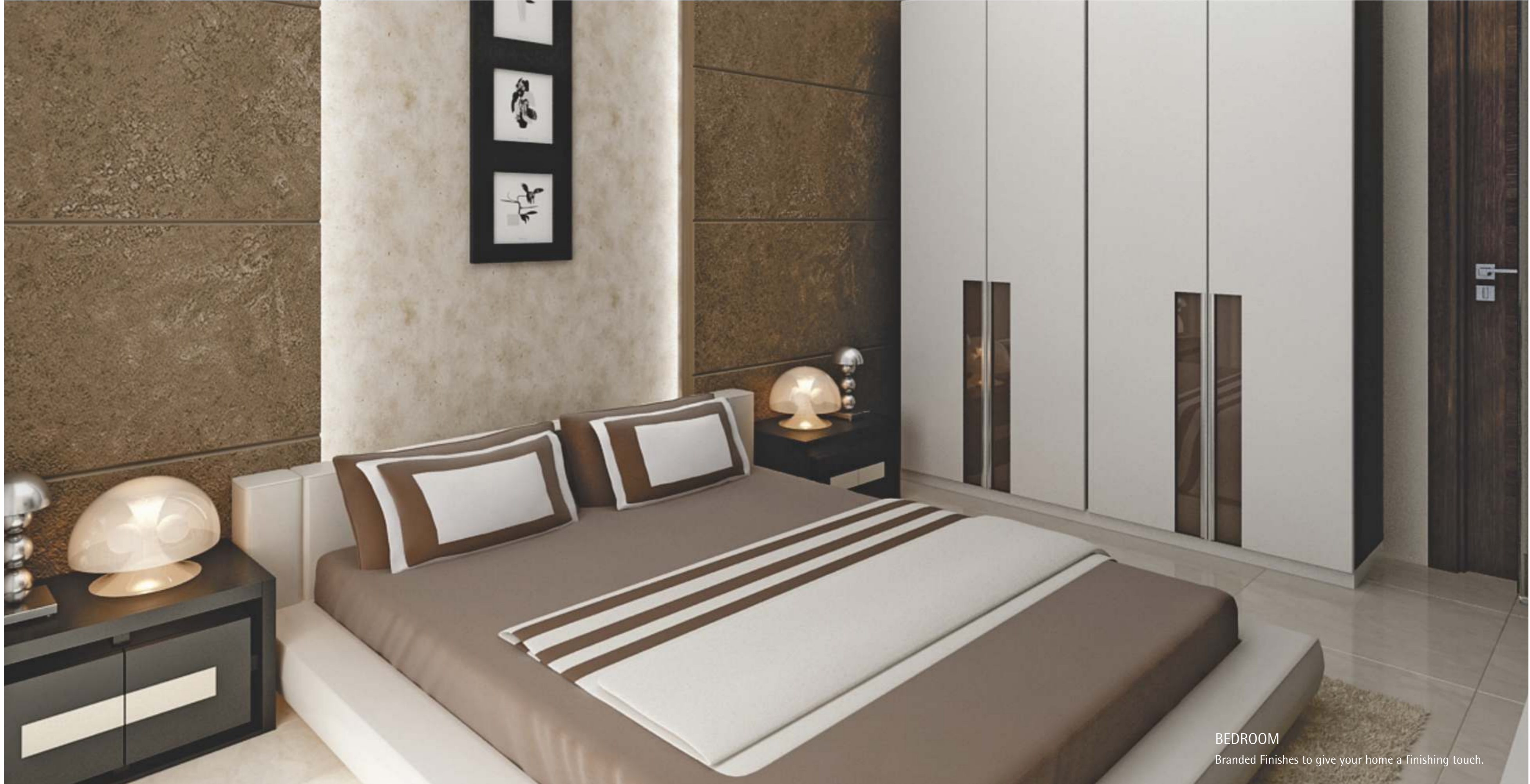
BEDROOM Branded Finishes to give your home a finishing touch.