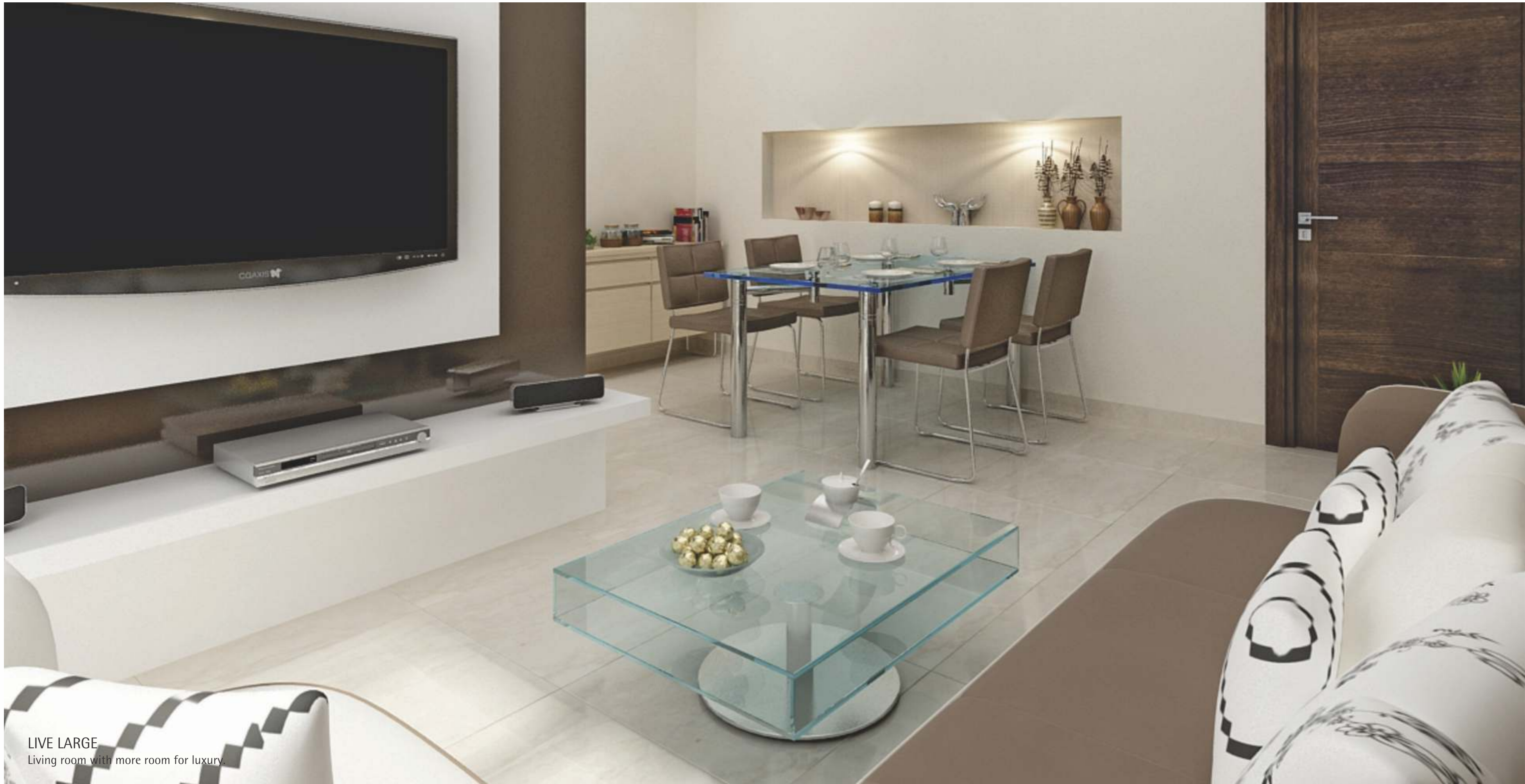
LIVE LARGE Living room with more room for luxury.